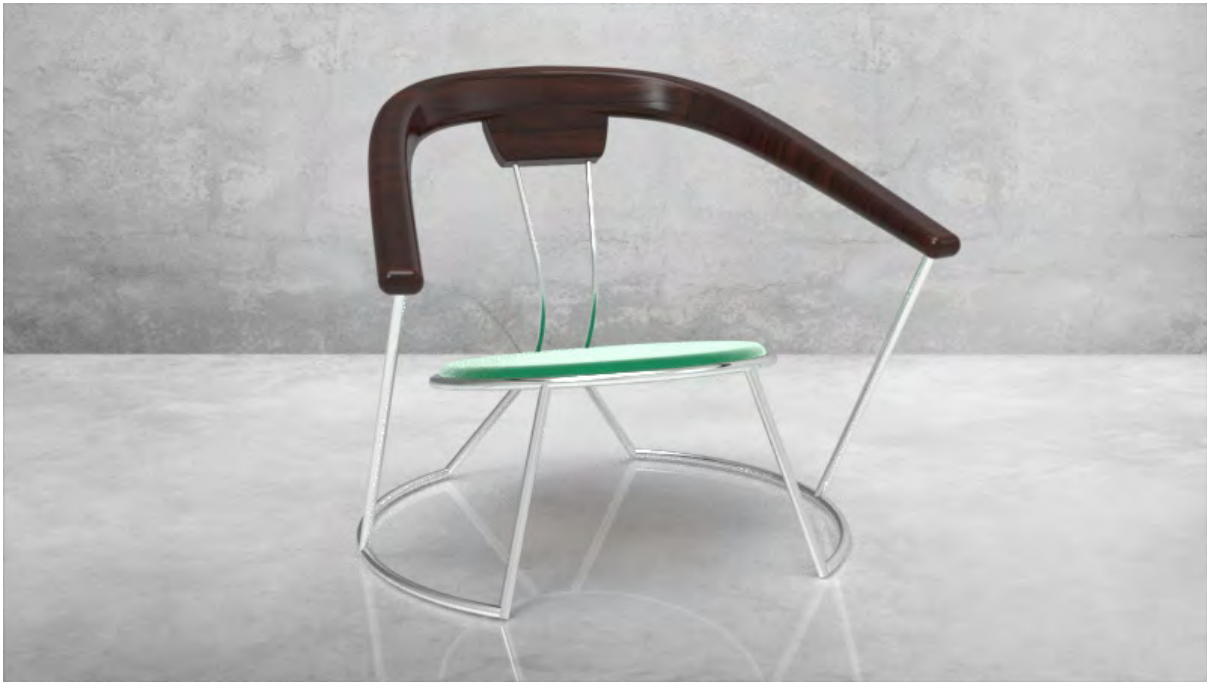
Figure 1.1 The image of Senggok 3d design