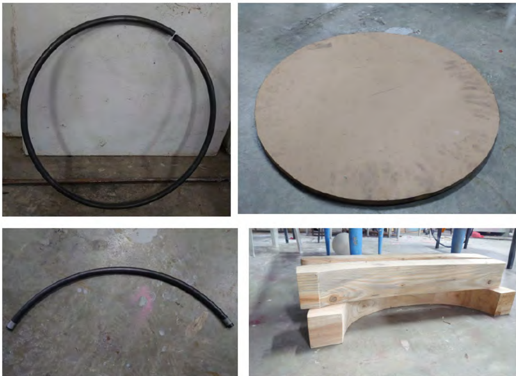
Figure 1.2 The images of material and method