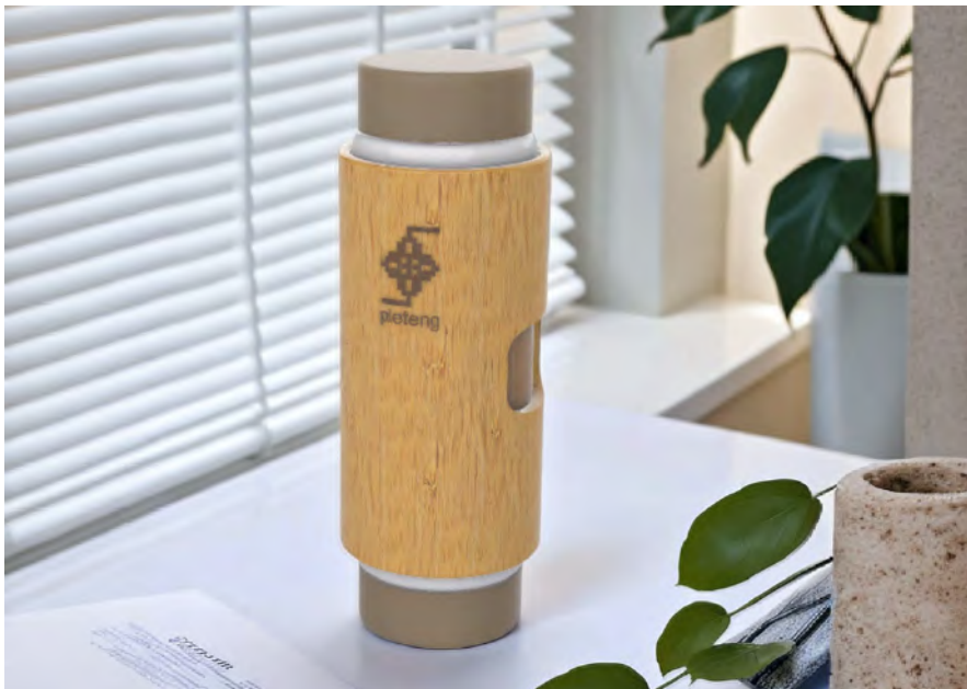
The picture of Environment (PLETENG)

In conclusion, the Pleteng dual-compartment tea tumbler successfully bridges Malaysian cultural heritage with modern functionality by combining the elegance of Tenun Pahang motifs with a practical design suited for both hot and cold beverages. It highlights the potential of reinterpreting traditional craftsmanship for contemporary lifestyles while supporting Kraftangan Malaysia's mission of cultural preservation and innovation. The design not only addresses usability, portability, and durability but also elevates cultural appreciation in everyday tea-drinking practices. Moving forward, incorporating sustainable materials and expanding design variations could further enhance its relevance and strengthen its appeal in both local and global markets.