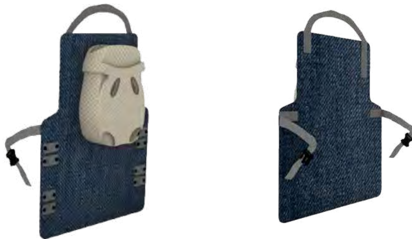
Figure 1.1 The picture of final body structure

The PAWKET apron is made from denim, chosen for its durability, flexibility, and ease of cleaning. The main innovation lies in the large front pocket, which includes four leg holes to hold the cat securely, a zip opening to place the cat inside, and an