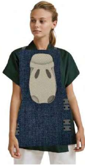
Figure 1.3 The picture of Environment (PAWKET)