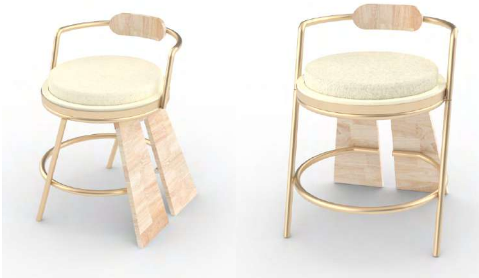
Figure 1.1 The picture of final body structure

The final design of the Serena Sustainable Vanity Chair (Figure 1.1) is a beautiful blend of metal, wood, and fabric. At its core, you'll find high-quality wood, expertly shaped to create a smooth, organic silhouette that embodies the soothing vibe of Scandinavian design. To ensure it stands the test of time, a sturdy steel frame is incorporated into the structure. This frame is meticulously welded, providing strength without compromising the chair's sleek appearance.