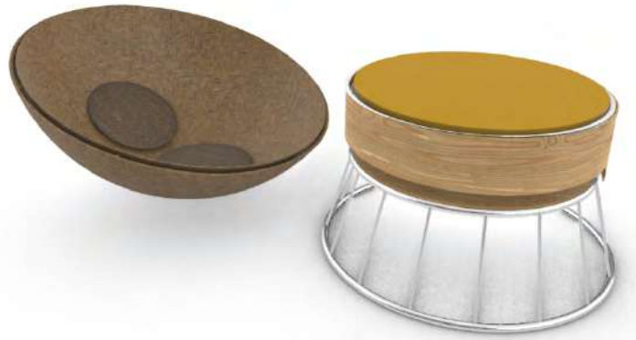
Figure 1 The Luna Bowl Chair

more adaptable for small or flexible living spaces. The woven shell structure provided a visually enclosed look, giving a sense of protection and warmth. The metal frame offered strong support, and during testing, small refinements were made to the seat tilt and cushioning. Overall, the chair was well-received for its comfortable feel, solid handcrafted aesthetics, and multi-functional use.