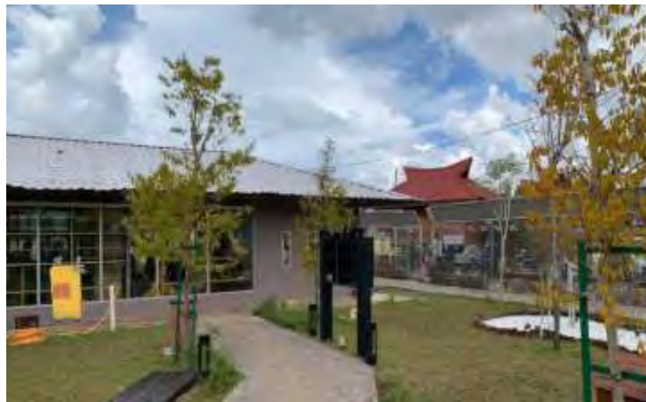
Figure 1.3 The picture of Environment (Tidypaw Station)

care settings. The proposed design addresses key shortcomings in existing trolleys by incorporating modular compartments, easy-to-clean surfaces, and user-friendly mobility features. Survey results show that ease of cleaning, safe storage, and ergonomic handling are the top priorities among users. It is therefore recommended that the prototype be tested in real working environments, with further improvements focused on sustainable materials and animal comfort. Future development should also consider scalability and provide basic ergonomic training for users to maximize the trolley's functionality and long-term impact.