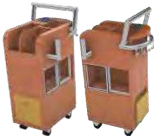
Figure 1.1 The picture of final body structure

The design and development of the multifunctional cat trolley station employed a combination of plastic and metal materials to achieve a balance between durability, ease of cleaning, and structural support. High-density polyethylene (HDPE) or polypropylene (PP) plastic was selected for the main body casing, internal dividers, and detachable trays due to their lightweight nature, chemical resistance, and ease of maintenance. These plastics are commonly used in hygienic environments because they are non-porous and easy to disinfect, making them suitable for handling animal-related waste and ensuring quick sanitation turnaround.