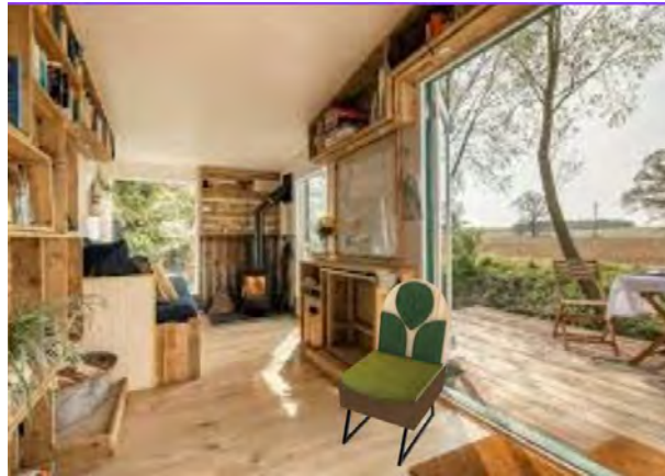
Figure 1.3 The picture of Environment (LITLOUNGE)