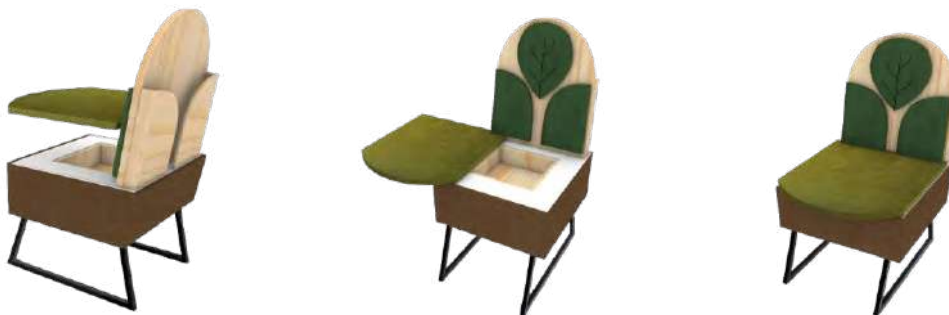
Figure 1.1 The picture of final body structure

This project, crafted as part of the Industrial Design Project course, dives into the creation of a multifunctional reading chair designed specifically for book enthusiasts. The Litlounge slipper chair combines ergonomic principles with a biomimicry design approach, aiming to boost both physical comfort and user interaction. The main objective is to develop a product that's not only meaningful and engaging but also aligns with the daily habits of readers, promoting relaxation and sustainable practices. This course project encourages students to collaborate across various fields product development, user research, 3D rendering, and branding providing a well-rounded industrial design experience. The Litlounge embodies a blend of functional thinking and