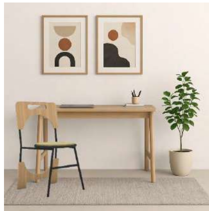
Figure 1 Rangkah in environment

The development of Rangkah began with a study of the Sustainable Development Goals (SDGs), particularly SDG 12: Responsible Consumption and Production and SDG 11: Sustainable Cities and Communities. These guided the focus on sustainability, material efficiency, and long-term usability in the design. I aimed to strip the chair down to its essential function, focusing on simplicity, durability, and portability, which is key to the nomadic concept. I studied existing nomadic designs that emphasised modularity and ease of movement, which influenced the form, material choices, and overall proportions of Rangkah. The final design combines a steel frame with removable rubber wood elements, making it easy to maintain, transport, and adapt. The lower wooden support reinforces the back legs to prevent splaying, ensuring structural stability while maintaining a minimalist aesthetic suitable for flexible living spaces.