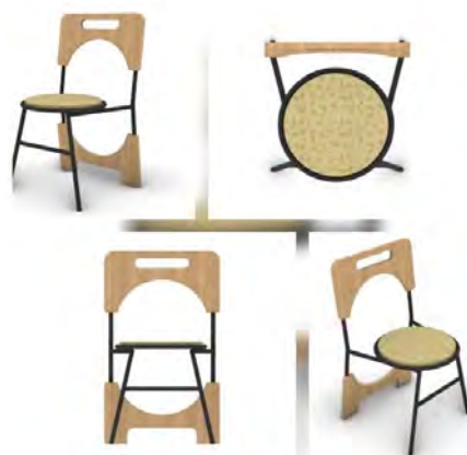
Figure 2 Rangkah Final Product

This construction approach enables the backrest and lower wooden support to be removable, allowing for easier transport, maintenance, and part replacement. The lower wooden brace specifically enhances the chair's structural stability by preventing the rear legs from splaying outward ('terkangkang') under pressure.