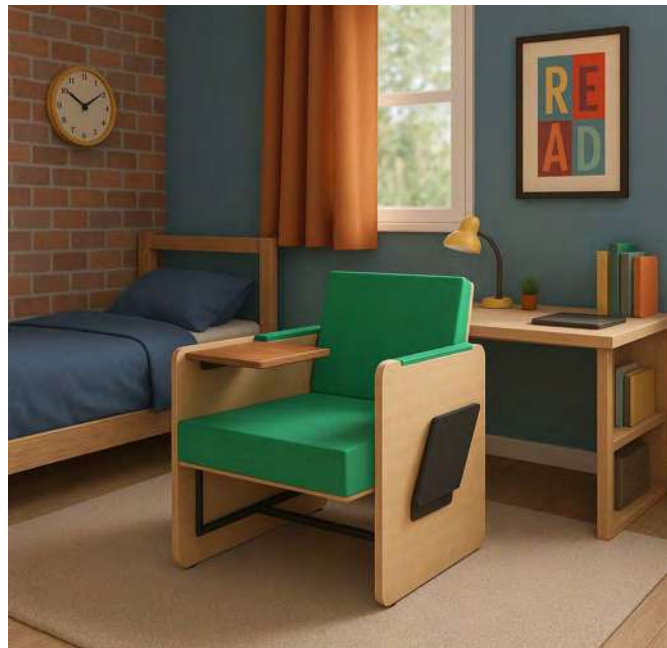
Figure 2 The picture of Environment (CHILLAXER )

easy to use, comfortable to sit in, and functional for daily activities. It shows how combining style with user needs can create a product that feels personal and useful. In the end, CHILLAXER is more than just a chair; it's a place to chill, read, and be yourself.