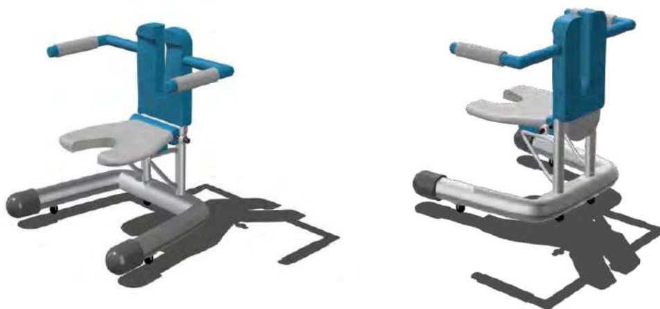
Figure 1: STRIDE+

STRIDE+ is an innovative and practical walking aid crafted to assist elderly individuals and those with physical disabilities during toileting and ablution (wudu') tasks. Many mobility aids on the market fall short when it comes to wet, cramped, or culturally sensitive spaces. STRIDE+ addresses this issue by merging three essential functions into one handy tool: walking support, toilet assistance, and help with ablution. Constructed with non-slip grips and made from waterproof and rustproof materials, it features a flip-up seat that ensures safety and ease of use, even in small bathrooms and wet areas like those found at the Murtadha Dakwah Centre (MADAD). Plus, its lightweight, flappable seat and durable wheel design make it a breeze to store and transport. This product was born from careful observation of real users, conversations with carers or family members, and a thorough examination of the challenges present in current facilities. STRIDE+ embraces universal design principles to promote independence, comfort, and dignity. It's a straightforward yet impactful solution that makes hygiene routines easier, safer, and more respectful for those facing mobility challenges.