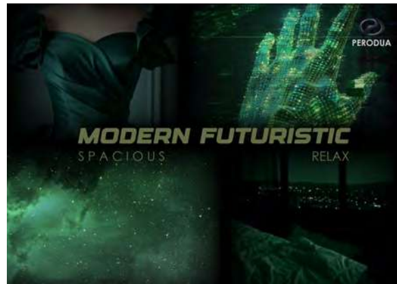
Figure 1.1 The picture mood board for the inspiration