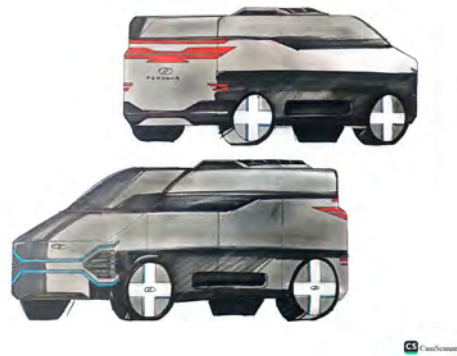
Figure 1.2 The picture of final design of the transport (Tigra-X)

Getting around is easier than ever with services like Grab, but many passengers, especially families, VIPs, and group travelers are still facing rides that feel cramped, uncomfortable, or simply not built with their needs in mind. That's what sparked the idea behind this project to design a better kind of ride-hailing vehicle, one that offers more space, comfort, and a modern touch. This concept imagines a new MPV (Multi-Purpose Vehicle) through a collaboration between Perodua and Grab, aiming to deliver a ride that's not only practical but also premium and future ready. The design process began with creating a mood board to capture the feel of what we wanted to build. The inspiration came from modern, futuristic aesthetics, combining sleek lines, smart technology, and a sense of comfort that fits today's lifestyles. Throughout the journey, we used the human-centred design approach to stay focused on what real users need. From early sketches to the final prototype, the goal remained the same: to design a vehicle that feels safe, spacious, and stylish for