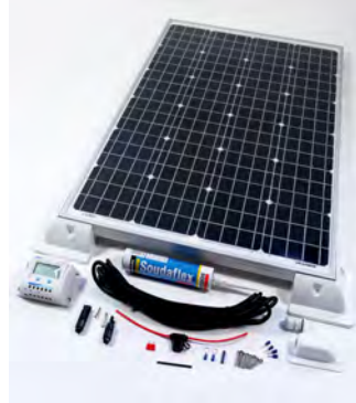
Figure 1.5 Solar Panel

Designing a vehicle that truly meets user needs requires more than just a stylish exterior; it's about understanding how people move, what they value, and the small discomforts that often go unnoticed. Through early research and observation, it became clear that many passengers, especially families and VIP clients, often feel limited by the current ride-hailing vehicle options. Common concerns included tight spaces, lack of privacy, minimal comfort features, and a growing demand for more environmentally friendly transport solutions. These insights directly shaped the design of the Perodua x Grab MPV. The final concept features a spacious layout, comfortable seating, and user-focused elements such as smart infotainment systems, improved accessibility, and privacy-enhancing design. Inspired by modern and futuristic aesthetics, the overall form maintains practicality while appealing to current design trends.