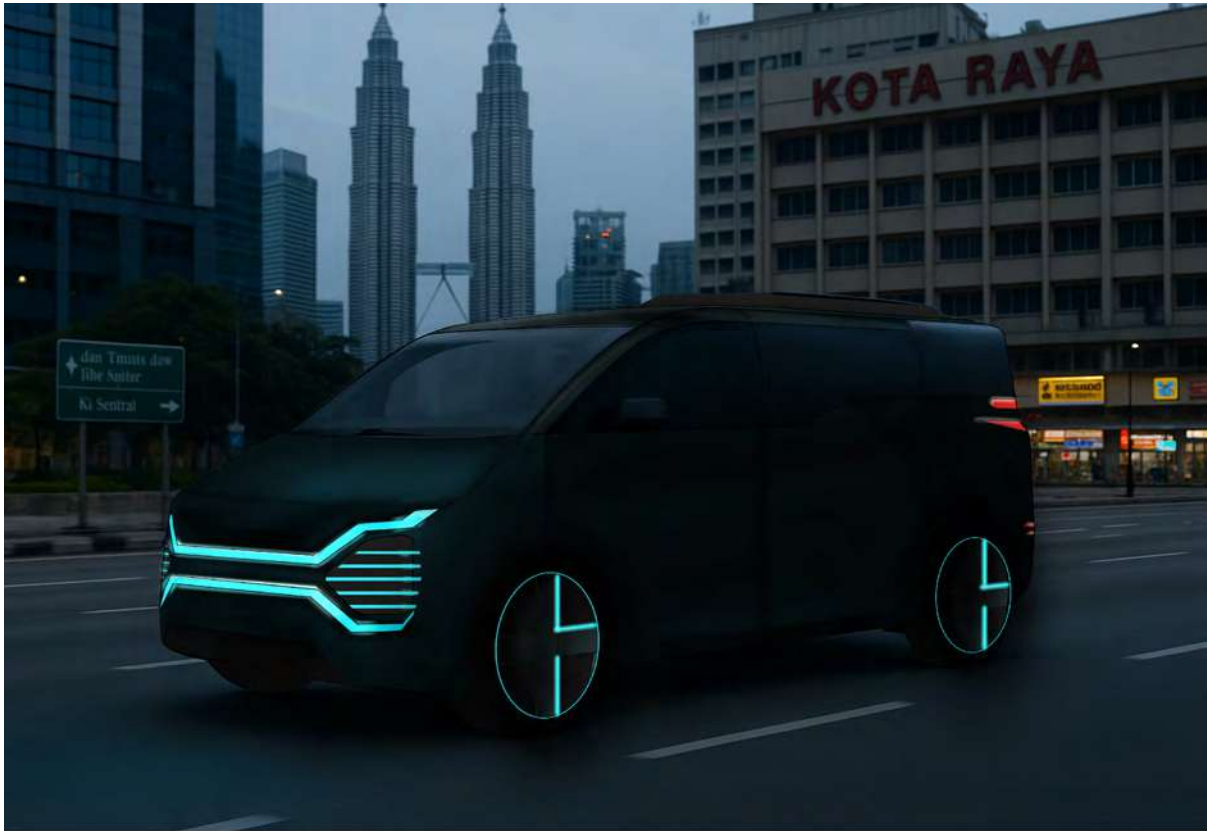
Figure 1.6 The picture of Environment (Tigra-X)

The Perodua x Grab MPV design concept showcases how human-centred design can effectively address real-world transportation needs while respecting user diversity. By focusing on comfort, accessibility, safety, and environmental responsibility, the vehicle provides a premium ride experience for families, VIP clients, and travel groups. Its spacious layout, smart technology integration, and eco-friendly features make it a practical yet modern solution for Malaysia's evolving ride-sharing services. It is recommended that future developments further explore sustainable materials, customisable interiors for different user types, and continuous technological upgrades to enhance user interaction and vehicle efficiency. Maintaining collaboration with local users and stakeholders is crucial to ensure the design consistently reflects user preferences and societal values.