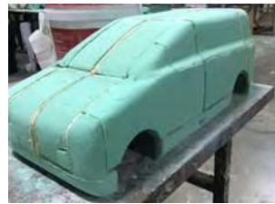
Figure 1.3 The picture of making model using green foam

The design development began with background research to identify the purpose and relevance of creating a new type of car. In this case, the concept focuses on a collaboration between Grab and Perodua to address the increasing demand for a premium, spacious, and user-friendly MPV for ride-hailing services. The idea was inspired by the need to improve passenger comfort, enhance privacy for VIP clients, and support sustainability through eco-conscious vehicle design. The process started with manual sketching, beginning from the ideation phase, where various concepts were explored through rough sketches.