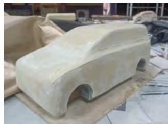
Figure 1.4 The picture after applying putty

This was followed by the idea development stage, where selected concepts were refined with more detailed drawings. In the design development stage, key features, such as form, function, layout, and style, were finalised. This led to the creation of the final design, which reflects the goals of the project: comfort, accessibility, modern aesthetics, and practicality. After finalising the design, a physical prototype was constructed to visualise the concept. Green foam was used for the base model due to its ease of shaping, while putty was applied to the exterior for a smooth finish. The model was completed using high-quality spray paint, giving it a clean and realistic