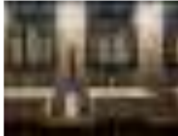
Figure 1.3 The picture of Environment (Everease)

minimalistic design, and biodegradable materials, Everease offers both functionality and environmental responsibility. The product not only enhances user experience in space-limited environments but also promotes sustainable living through thoughtful design.