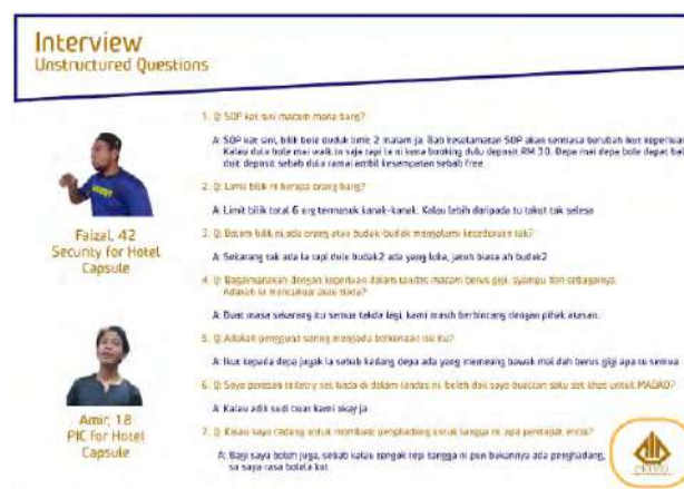
Figure 1.2 Asking respondents if they think that the toiletry set can be a problem-solving solution for vulnerable communities.

Based on the research and observations, users in capsule hotels prefer compact, hygienic, and easy-to-carry toiletry solutions. The findings showed that many existing products lacked organised compartments and sustainable packaging. Therefore, the Everease design focuses on providing a structured set that includes refillable containers, biodegradable materials, and a clean aesthetic. User personas, such as security officers, travelers, and short stay guests, were considered to ensure the design is adaptable and user-friendly.