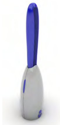
Figure 1.1 The picture of final body structure

The research for the Ever ease toiletry set design was carried out primarily through online observation, focusing on various capsule hotel websites, product design platforms, and existing toiletry solutions. This method provided insights into current trends, user needs, product usability, and material preferences. The design process followed the design thinking approach empathising with users, defining key problems, ideating solutions, prototyping a compact toiletry set, and evaluating its