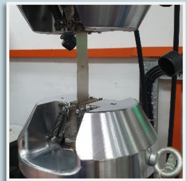
Tensile testing of the specimen

This research provides valuable insights into the electro-thermo-mechanical behaviours of micro-TIG-welded joints and offers a unique perspective on optimizing this technique for electric vehicle battery interconnects.