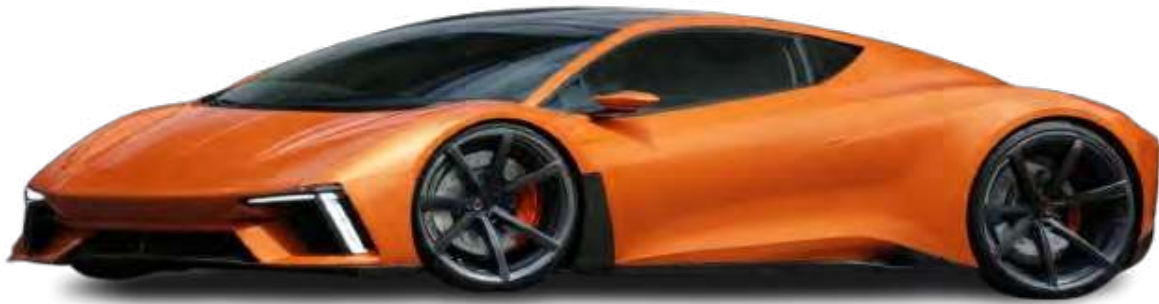
Figure 1.1 The picture of final body structure