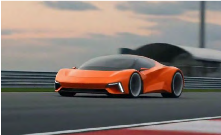
Figure 1.2 The picture of Auraz supercar test drive in a racetrack

For future development, it is recommended to continue improving the hybrid system for longer battery range and faster charging. More focus can also be placed on smart features like self-driving technology, digital displays, and enhanced safety systems. Marketing efforts should highlight AURAZ as a symbol of national pride and innovation to attract both local and international buyers.