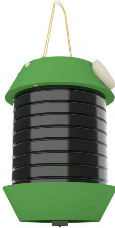
Figure 1 WASH+