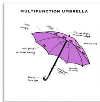
Figure 1: The GlowGuard Multiflex Umbrella

The GlowGuard Multiflex Umbrella is a revolutionary product that offers safety and convenience. It features Safety Shining Tape on the Outer Canopy, which enhances visibility in low-light conditions, enhancing safety during walks or commutes according to Robustt Store (Store, 2023). The Mini Purse on the Inner Canopy provides secure storage for small essentials, eliminating the need for additional bags or pockets. The LED White Lamp on the Inner Canopy provides supplementary lighting for enhanced visibility, making it useful in indoor settings or during cloudy days (Austin, 2024). Two hooks on the Shaft allow users to hang items, freeing up their hands and increasing convenience. Torch Light Sync with the Shaft provides convenient illumination for navigating dark streets or pathways during nighttime (Areaspy, 2024). The umbrella provides optimal protection and comfort, addressing common issues faced by umbrella users in metropolitan environments, such as lack of storage space and safety measures. The versatile design and focus on user needs make it a revolutionary option in the market (E, 2021).