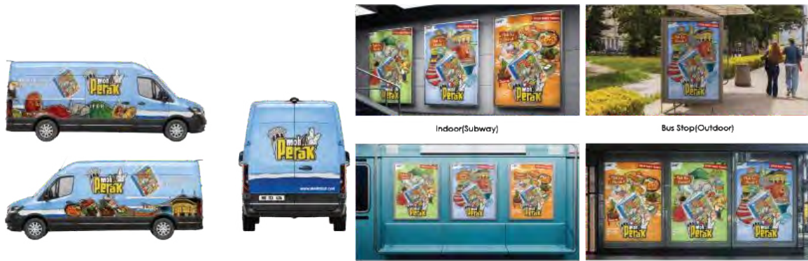
Figure 1.2 Overall items print design for Moh Perak