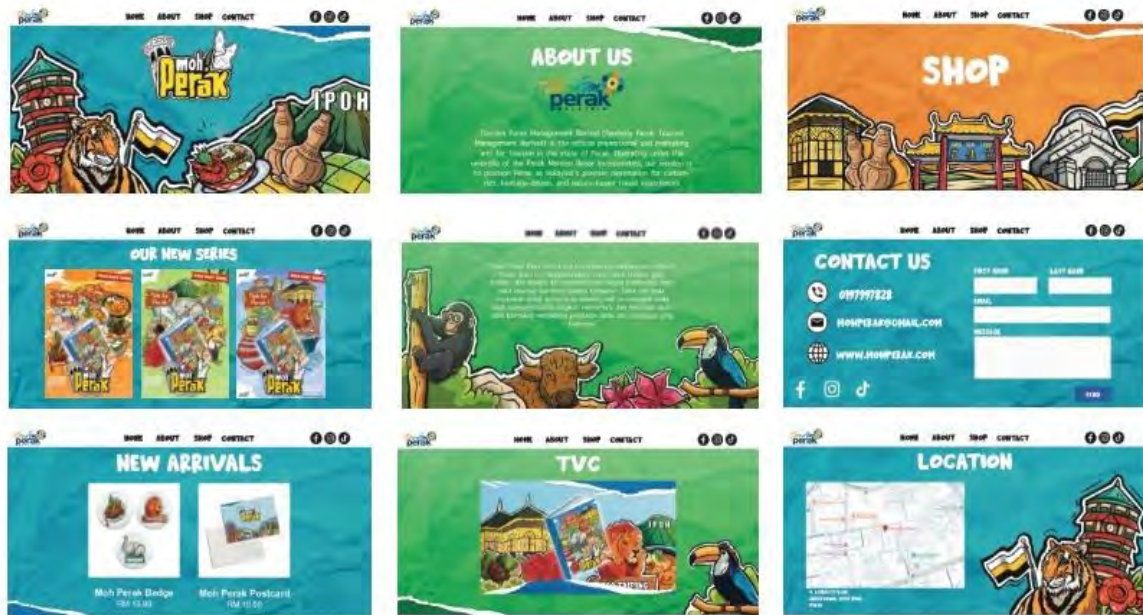
Figure 1.4 Official Website