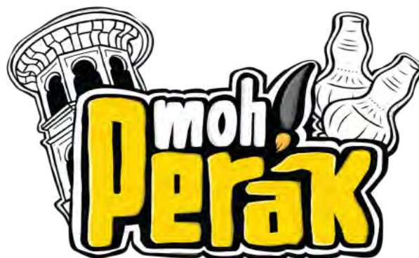
Figure 1.1 Logo design design of Moh Perak

Through this thoughtful blend of design, culture, and communication, the Moh Perak Diary Travel Book evolves into more than just a product. It becomes a vibrant cultural experience that encourages exploration, celebrates identity, and connects people to the stories and symbols that define the heart of Perak.