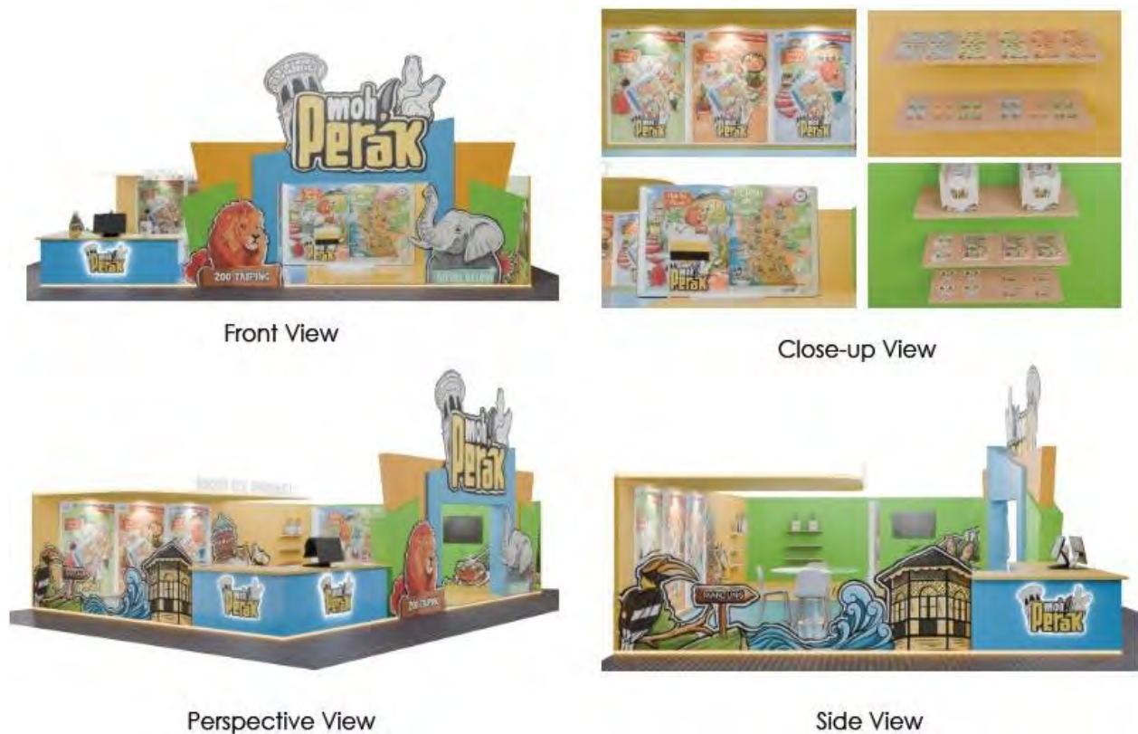
Figure 1.3 Exhibit Design

Throughout the project, the focus remains on consistent branding, effective communication, and thoughtful user experience. Every touchpoint, from the smallest animation to the broader interactive journey, reflects the vision of connecting the traditions of Perak with the expectations of today's digital audience. In uniting culture with creativity, the Moh Perak digital design project successfully reimagines how heritage can be celebrated in the modern world. It is not just a showcase of design skill, but a vibrant invitation for audiences to discover, connect, and explore the spirit of Perak in entirely new ways.