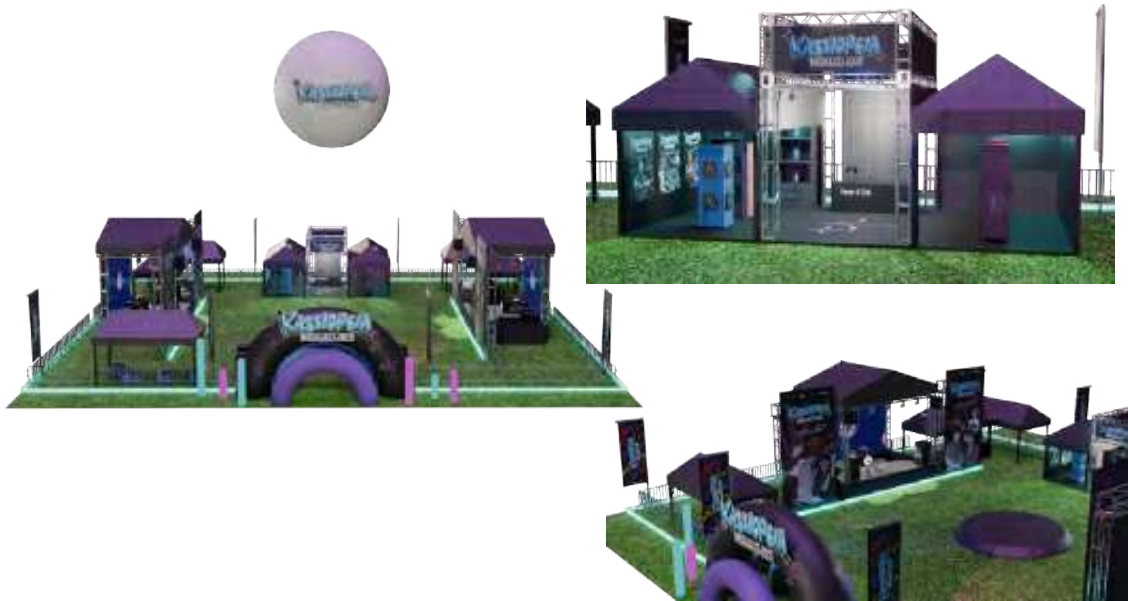
Figure 1.3 Exhibit Design