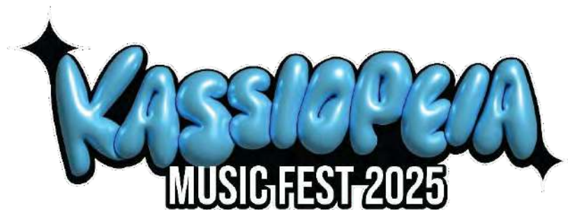
Figure 1.1 Logo design of Kassiopeia Music Fest

wearable and collectible items, serving as both promotional tools and cherished keepsakes for festival attendees. To complement these, a variety of advertising materials, such as print posters and mockups displayed throughout the city, are also created. From a wallscape billboard to hanging mobiles in community spaces and subway transit posters, these materials utilize eye-catching compositions, vibrant color palettes, and abstract designs to grab attention and convey the festival's raw energy. To bolster the festival's online presence, a series of Instagram posts are developed as well. These posts are crafted to deliver flexible yet visually cohesive announcements, schedules, countdowns, and engagement opportunities. Altogether, these components create a comprehensive visual system that effectively communicates the festival's identity in a clear and creative way across both physical and digital platforms.