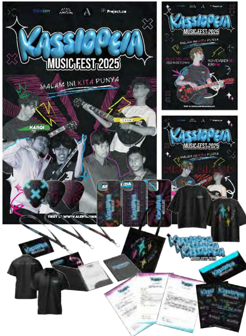
Figure 1.2 Overall items print design for Kassiopia Music fest

This identity shines through in various printed materials, including stationery, merchandise, advertisements, and Supporting Marketing Tools (SMT) like flyers, mockups, and Instagram layouts in print form. Together, these elements create a unified and expressive system that conveys the energy and emotion of the event, showing that print is not just thriving, but also a powerful medium for telling contemporary stories