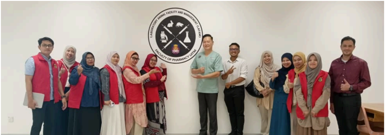
Day 2: Faculty tour facilitated by a dedicated lab team

The final day was dedicated to manuscript draft review sessions, facilitated by their UiTM co-supervisors, offering participants personalised feedback to refine their research proposals and improve academic writing quality.