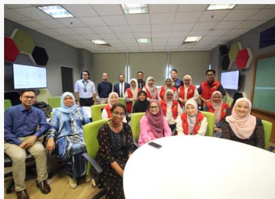
Day 1: Group photo at the Welcoming Ceremony