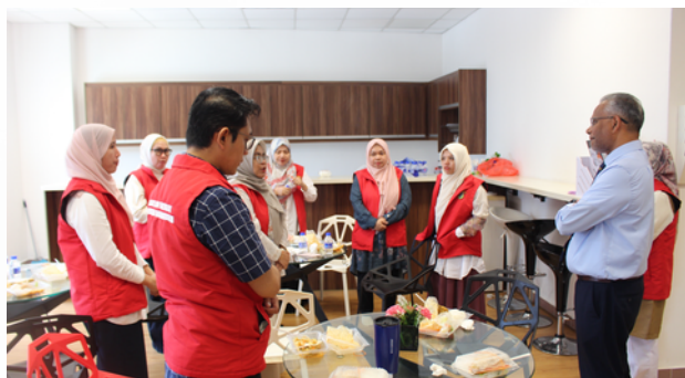
Day 1: UNHAS postgraduate students Meet & Greet with Dean

In the afternoon of the second day, the delegation toured the Faculty of Pharmacy's academic and research facilities. The tour included the analytical laboratories, clinical simulation labs, multipurpose teaching laboratories, and postgraduate workspaces. Informal discussions during the visit provided insights into UiTM's research culture, postgraduate support systems, and opportunities for publications and research grants.