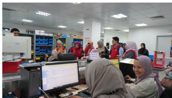
Day 2: Visit to Hospital Al-Sultan Abdullah facilitated by the Department of Pharmacy.