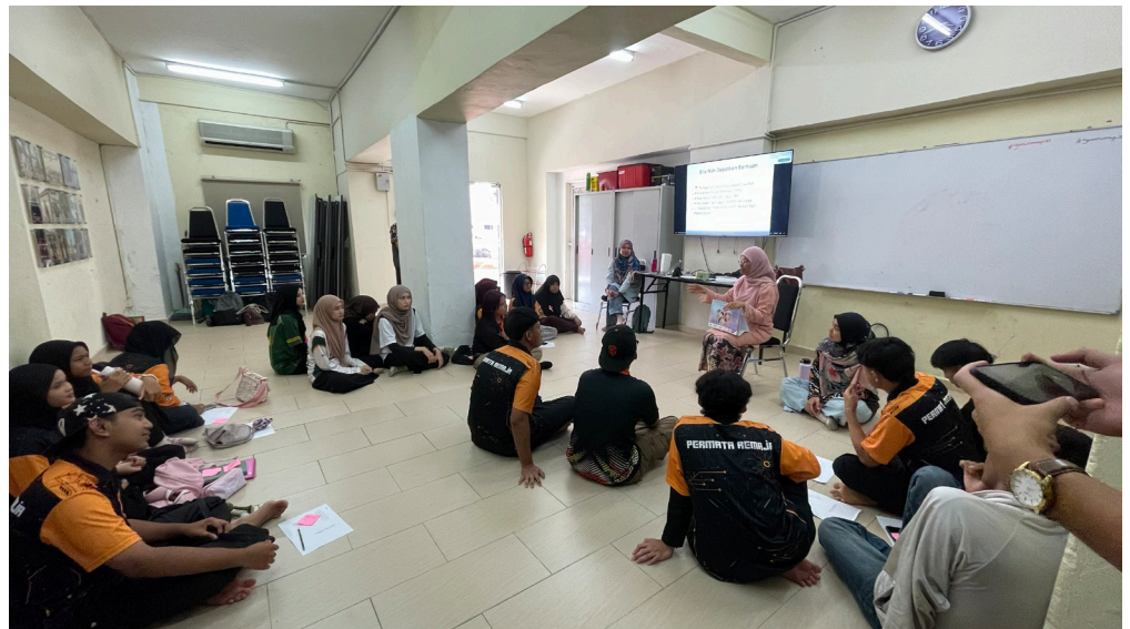
SESSION 2: "My Body, My Rights"