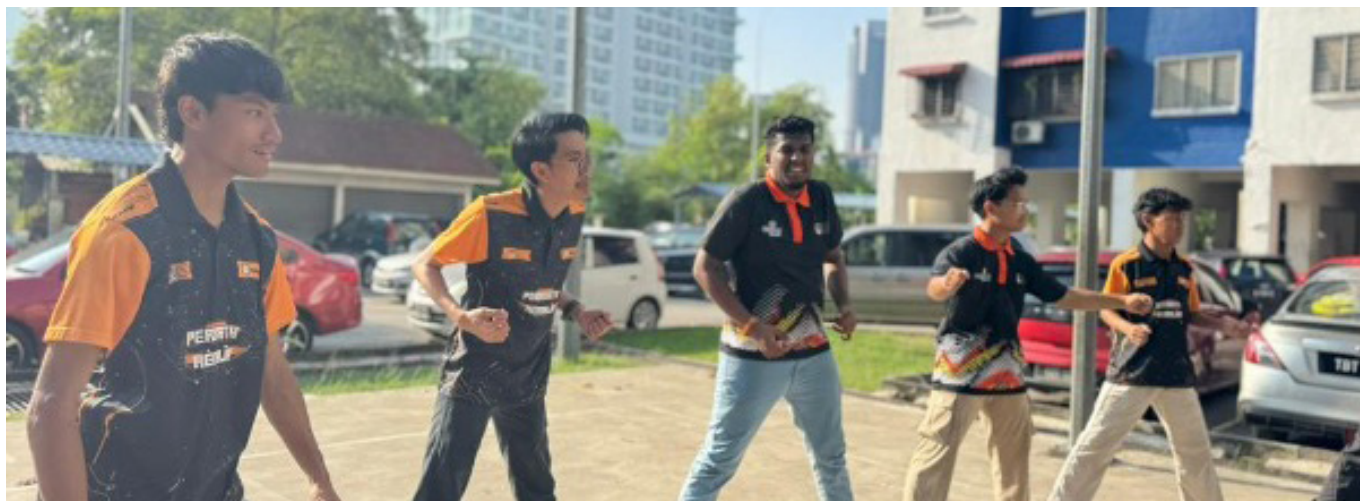
SESSION 1: Zumba session to kick off 'Move with Me' module at PPR Pantai Ria.