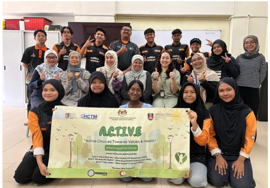
SESSION 3: Bridging the gap: FMS, medical officers and medical graduates with the participants during the session

The final instalment focused on adolescent mental health. Led by FMS from UiTM and UKM—and facilitated by UKM medical officers and UiTM alumni—the session demystified mental health issues. Participants practiced evidence-based stress management techniques in small groups. The program culminated in a "TED-Talk" style presentation, where participants analysed mental health challenges