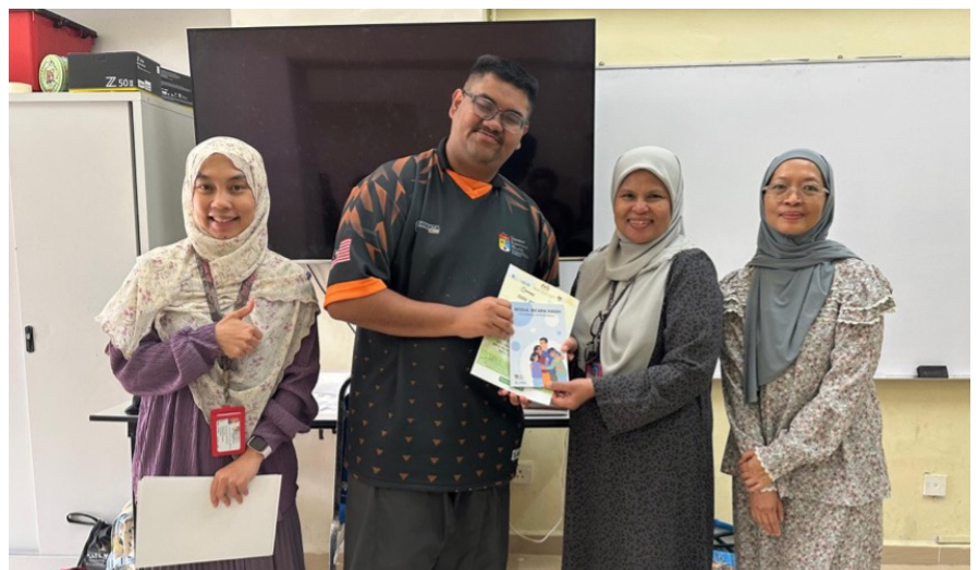
SESSION 3: One of the 'graduates', ready to be a Teen Community Health Advocate.

and proposed practical, community-level solutions.