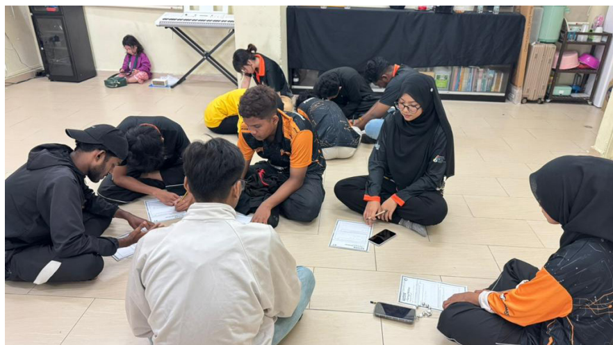
SESSION 1: Expressing thoughts on 'Healthy Lifestyle'

The program was structured into three half-day sessions conducted between September 2025 and January 2026.