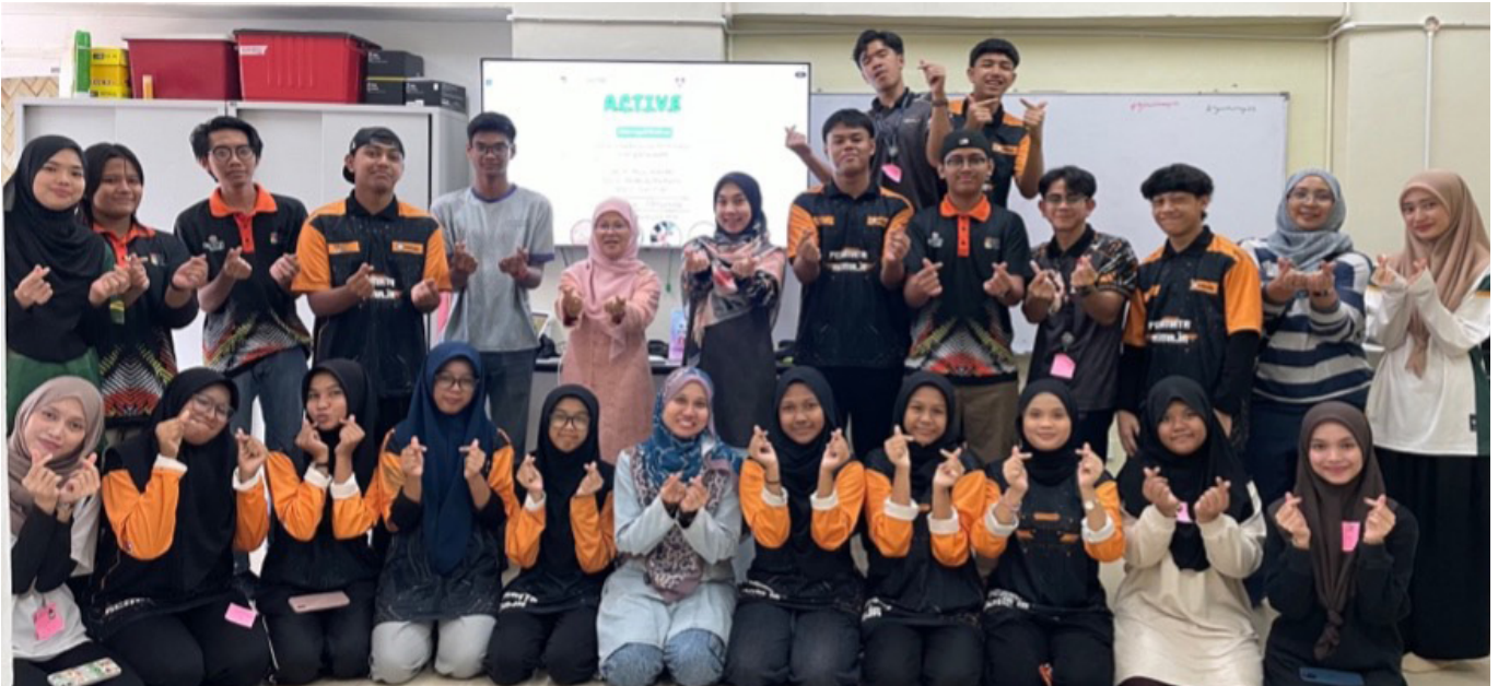
SESSION 2: Empowering the next generation: FMS specialists and facilitators guiding teens through the 'Modul Cakna Diri' on sexual and reproductive health.

mood. This was followed by an "Explorace," a gamified learning experience that tested participants' knowledge of healthy eating, the risks of smoking and vaping, and exercise physiology. The session concluded with a breakout group discussion titled "What is a Healthy Lifestyle?," allowing participants to exchange ideas and redefine health within their personal contexts.