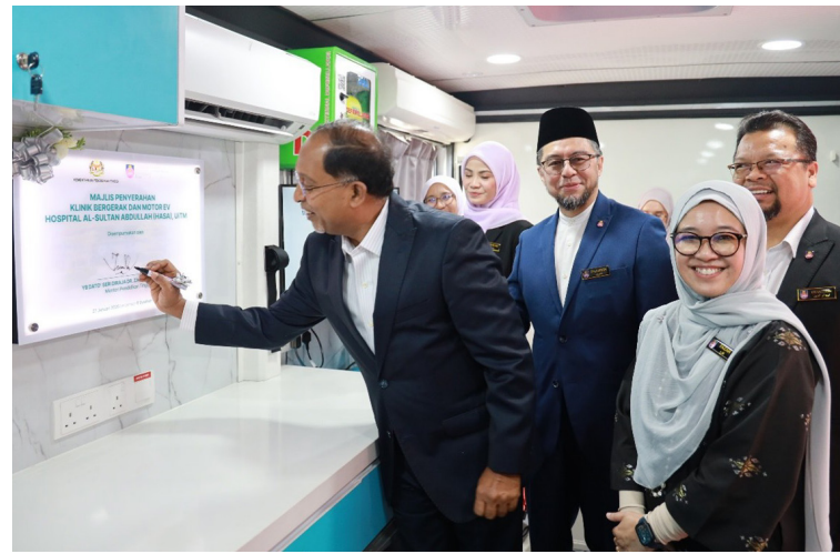
DATO' SERI DIRAJA DR. ZAMBRY ABD KADIR signing the plaque inside the mobile clinic.