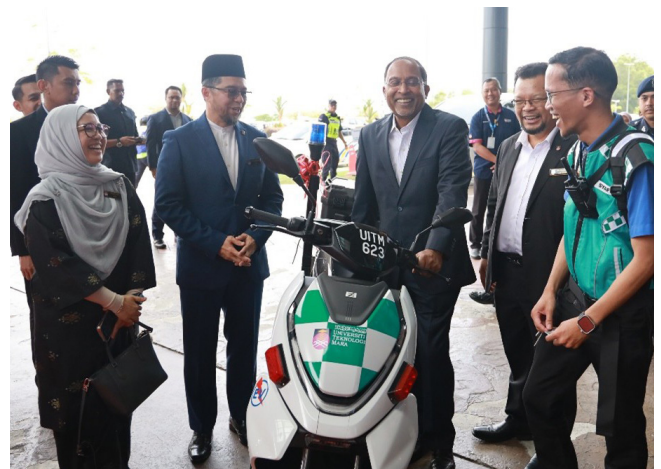
DATO' SERI DIRAJA DR. ZAMBRY ABD KADIR with the EV Motorcycle.

The mobile clinic is designed to support a wide range of community-based healthcare activities, including basic medical consultations, health screenings,