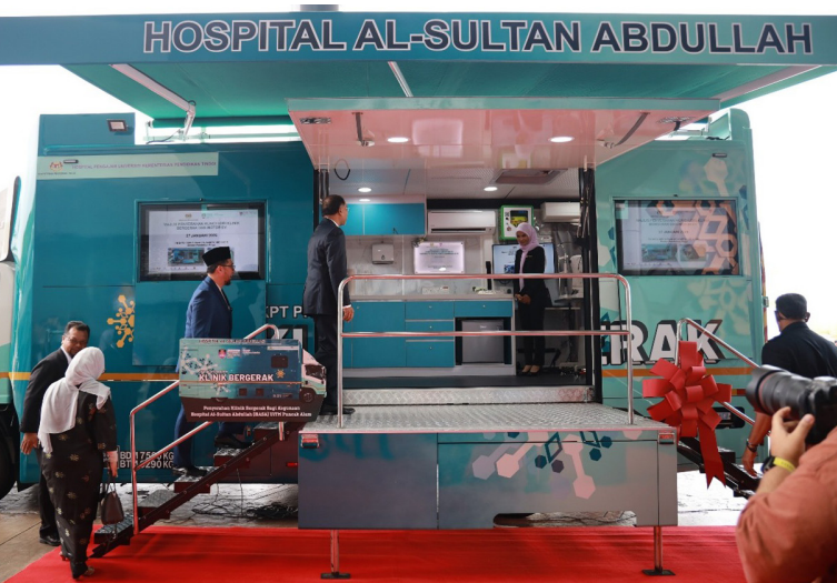
THE honourable guests entering the mobile clinic.