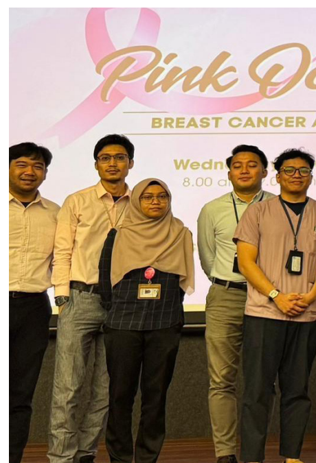
TEAM members from Department of