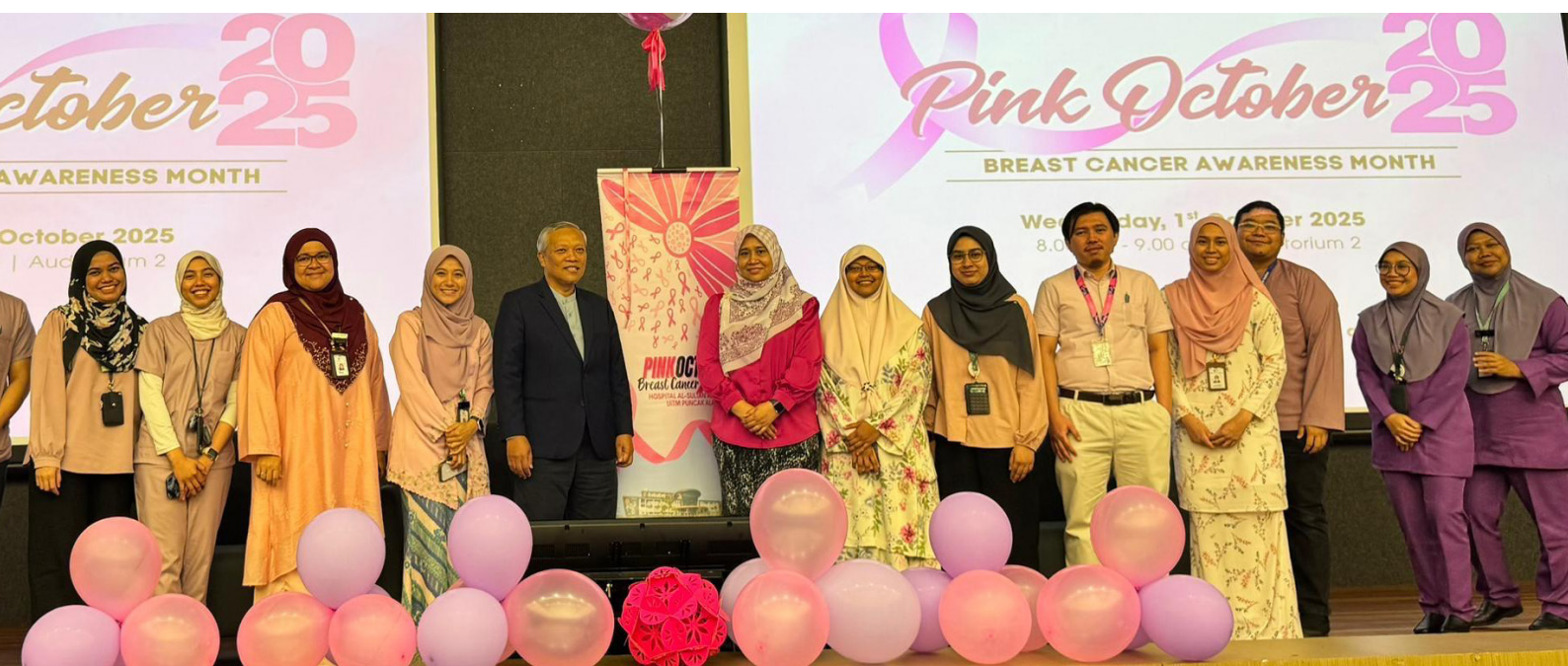
Surgery and Department of Radiology.

The event concluded with a viewing of breast cancer awareness posters prepared by the Departments of Surgery and Radiology.