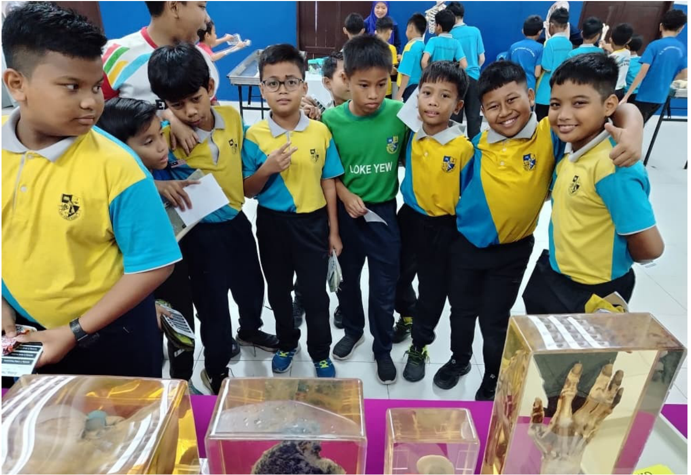
YEAR 5 students exploring the Anatomy Mystery Jar.