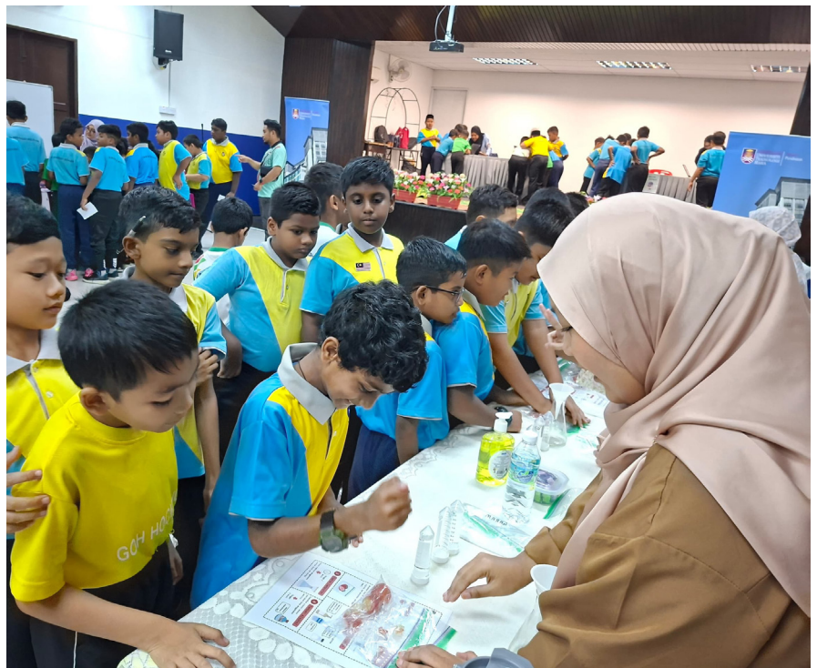
STUDENTS conducting hands-on DNA extraction activities.