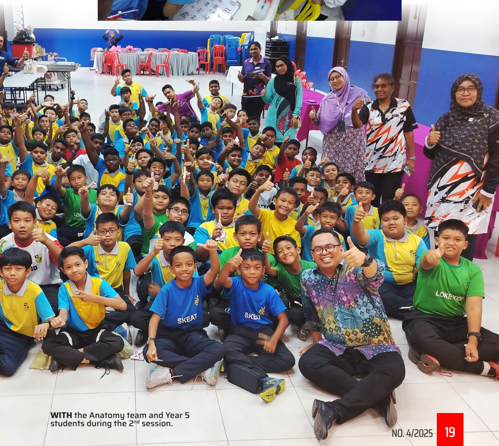
WITH the Anatomy team and Year 5 students during the 2 nd session.