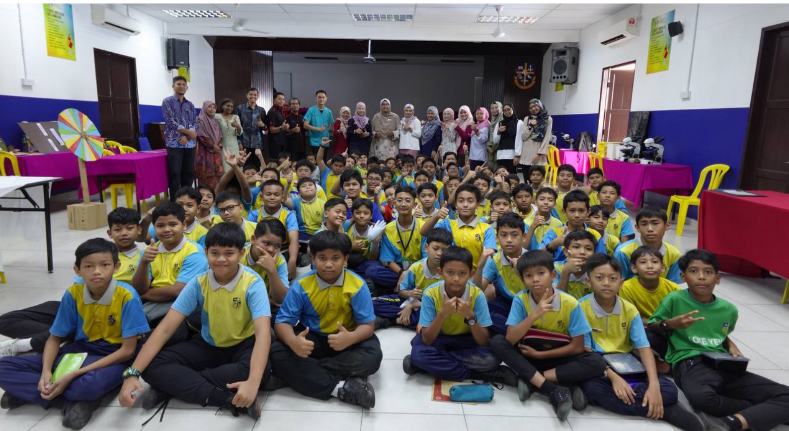
FACILITATORS with Year 6 students and teachers during Session 3 of STI 100 3 .