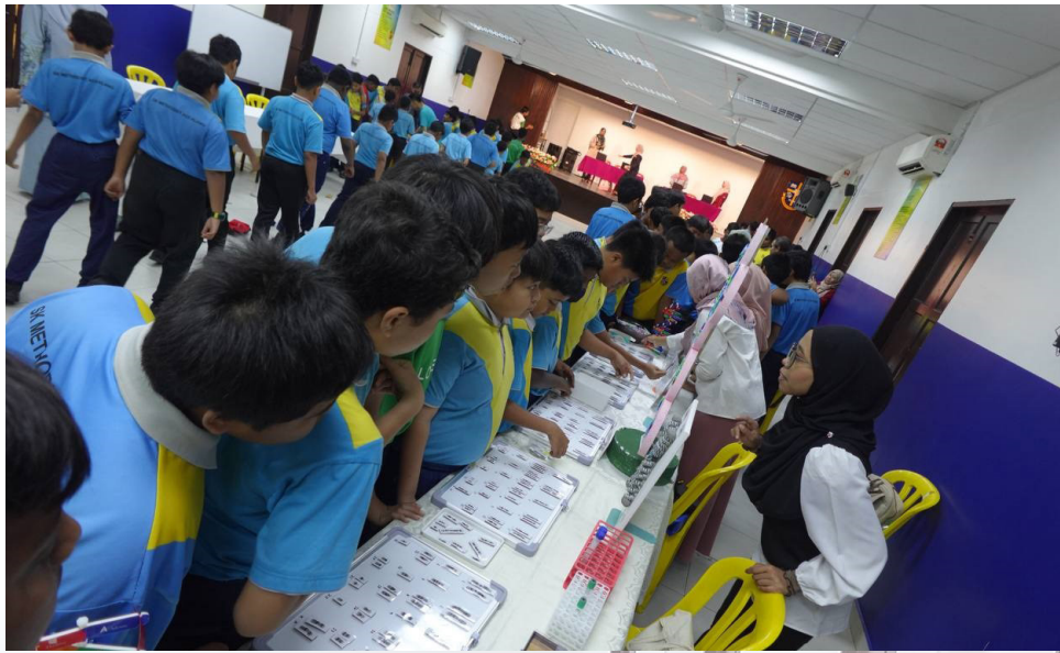
THE Genetic Pathology team guiding students in a hands-on karyotyping activity.