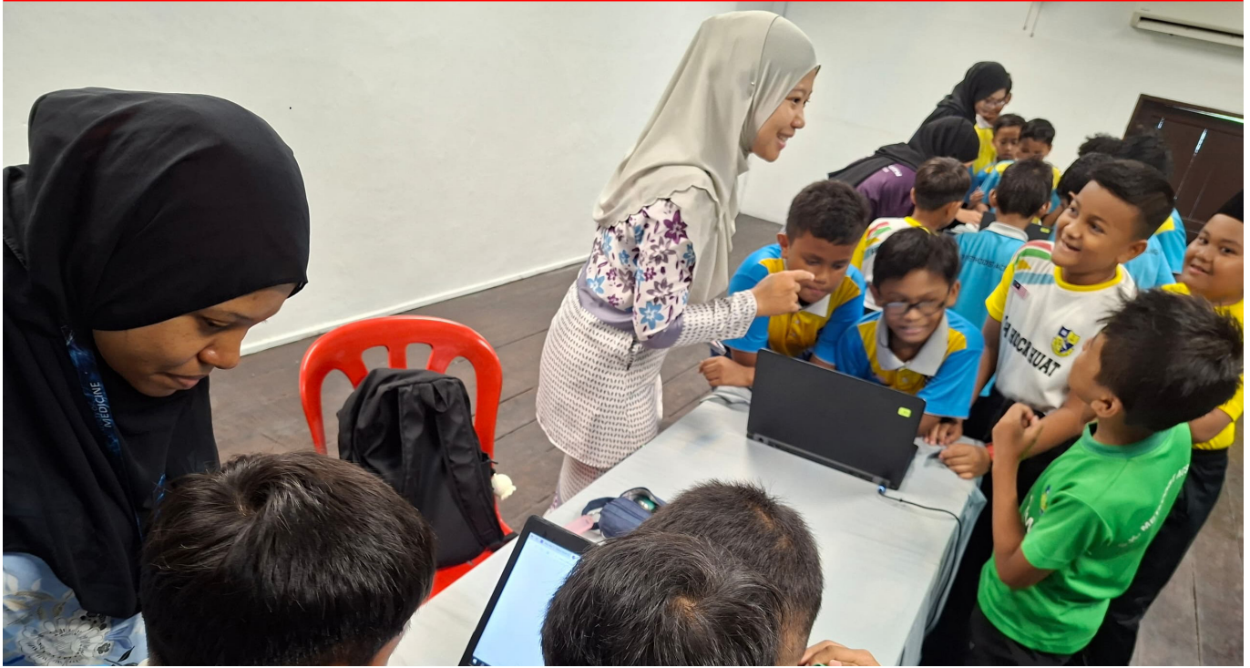
STUDENTS enjoying the mini escape games with excitement.

the Lab added an extra layer of excitement, blending problem-solving with teamwork while reinforcing scientific concepts.