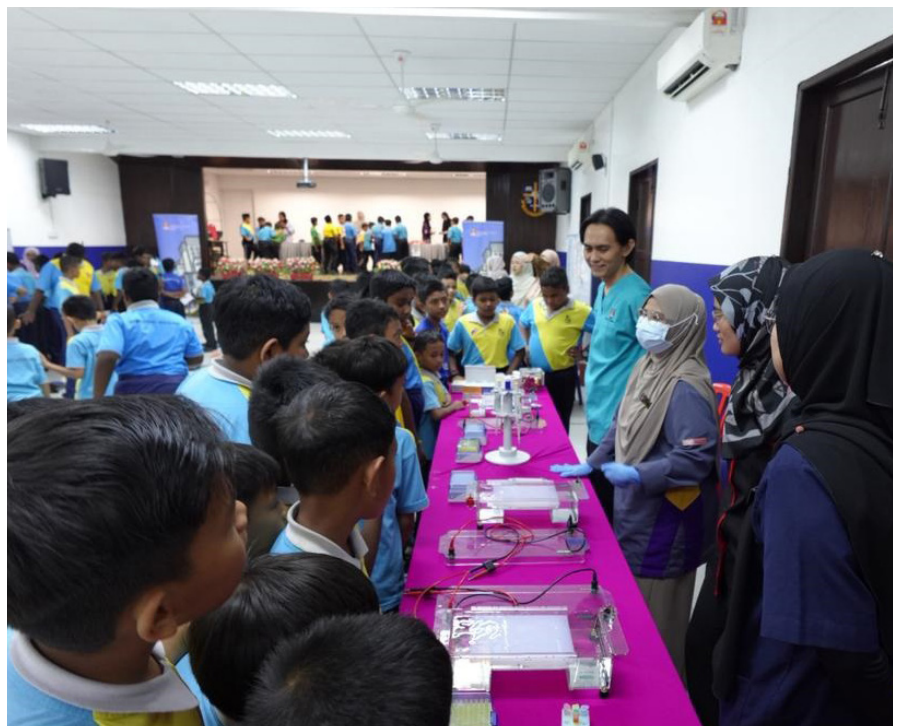
DNA electrophoresis station.

Following its nationwide launch earlier in July, where 8,804 scientists and 8,804 schools participated simultaneously, earning recognition in the Malaysia Book of Records, the STI 100 3 initiative continues to expand across selected schools nationwide. This effort represents an important step towards strengthening STEM education and inspiring the next generation of Malaysian scientists.