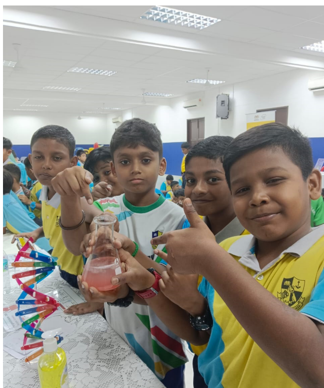
EXCITED Year 4 students uncover the hidden DNA inside strawberries.