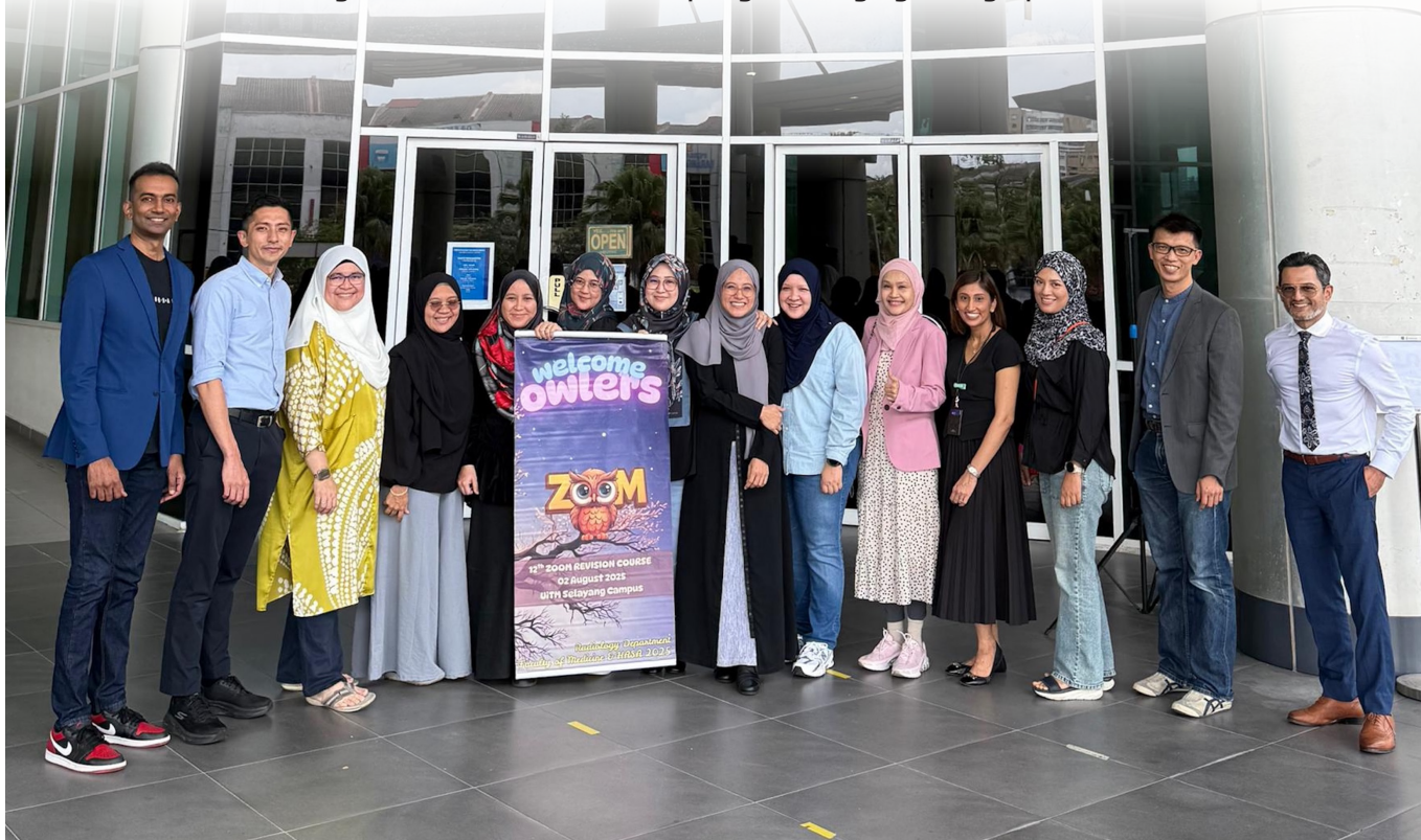
DEDICATED examiners and leaders in radiology education from various Universities, MOH and the private sector that generously shared their time to guide our little owls.