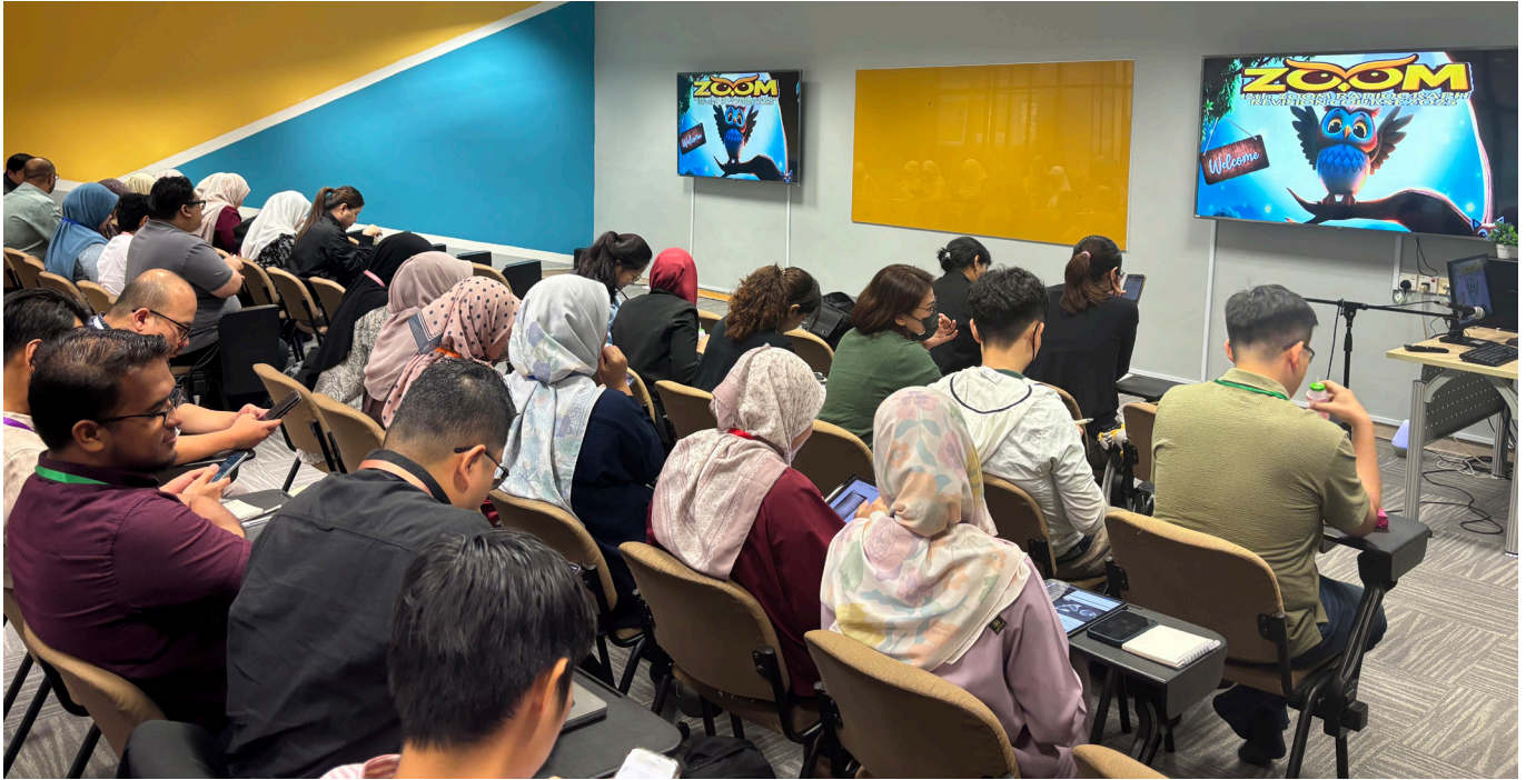
PRE-VIVA session talk. Little owls were given tips and strategies on effectively surviving the viva component.