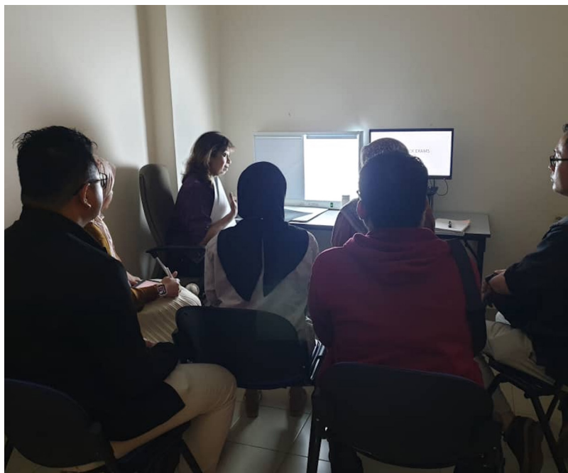
VIVA sessions in full swing. Nervous little owls attempting challenging radiographs.