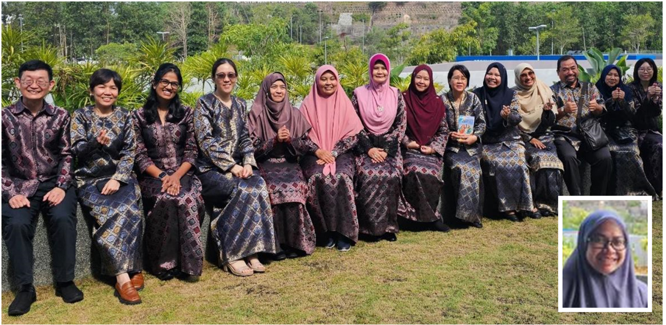
CPG Management of Asthma in Adults (Second Edition) development team.