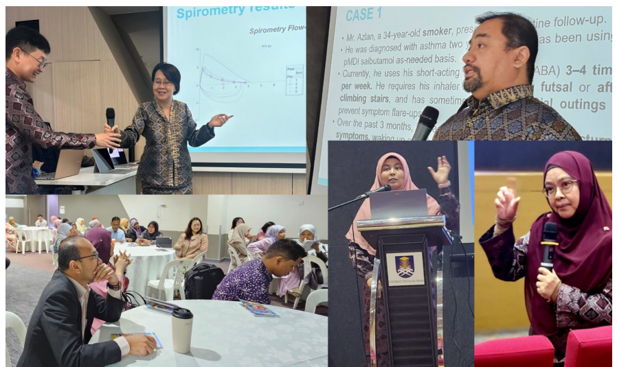
CASE-BASED discussion sessions.

A total of 233 participants attended, representing every State Health Department, Jabatan Kesihatan Negeri (JKN) Perlis, Kedah, Pulau Pinang, Perak, Selangor, Wilayah Persekutuan & Labuan, HKL, Negeri Sembilan, Melaka, Johor,