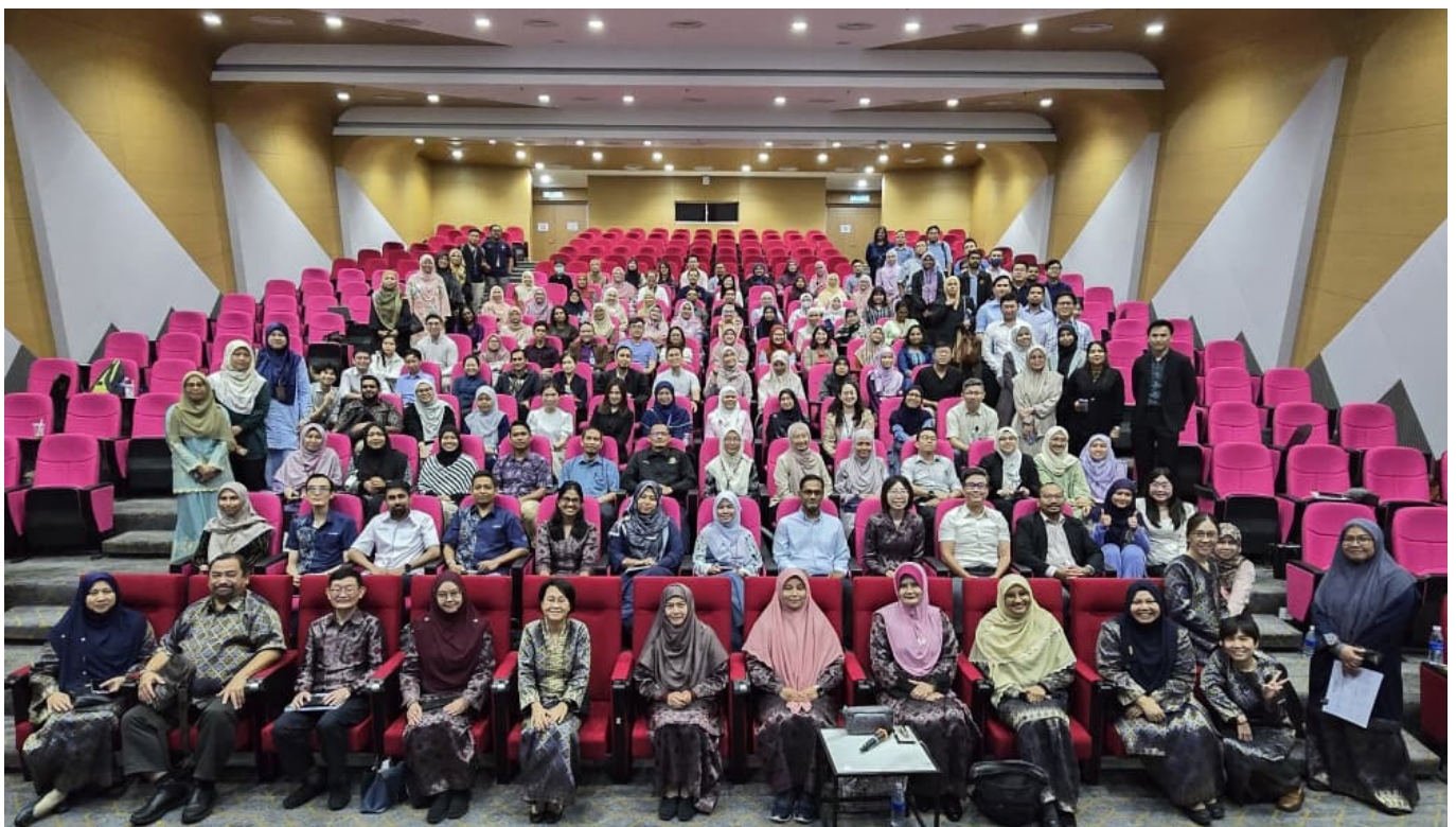
TRAINING of Trainers of Management of Asthma in Adults 2 nd Edition on 5 August 2025 in HASA Auditorium.

network of trainers ready to cascade the knowledge, the stage is set for real impact. The ultimate measure of success will be seen in better asthma control, fewer emergency visits, and improved quality of life for patients nationwide.