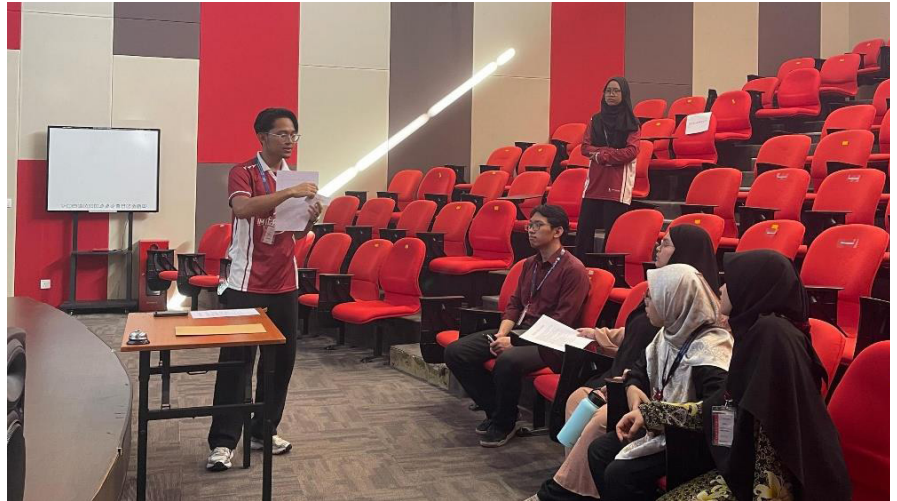
UiTM team in action during the first round, Explorace.

This year's competition was especially fierce, drawing 29 teams from universities across Malaysia, Thailand, Indonesia, and Singapore. UiTM's participation in IMICROBE is still young, having first competed in 2023 with a single team of third-year students. Building on that foundation, UiTM proudly fielded two teams this year, UiTM 1, the Junior Team, which consisted