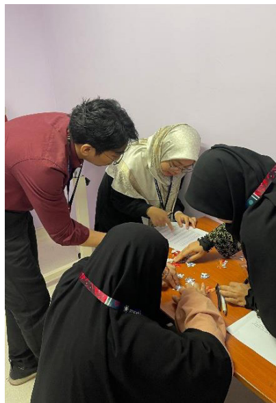
Explorace round: solving puzzles and MEQ questions.