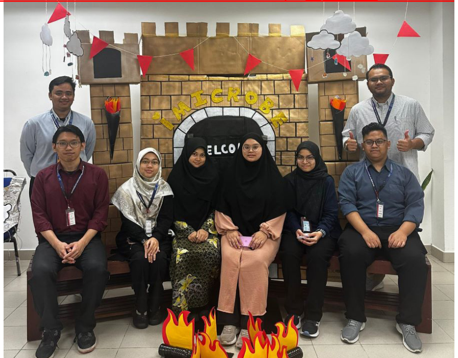
UiTM teams: UiTM 1, UiTM 2.

Although the podium eluded us, our students made us proud by showcasing resilience, determination, and the spirit of camaraderie. vRepresenting UiTM at an international platform alongside leading ASEAN universities gave them invaluable experience, testing their knowledge, sharpening their teamwork, and building the confidence to face challenges under pressure. Opportunities to participate in IMICROBE