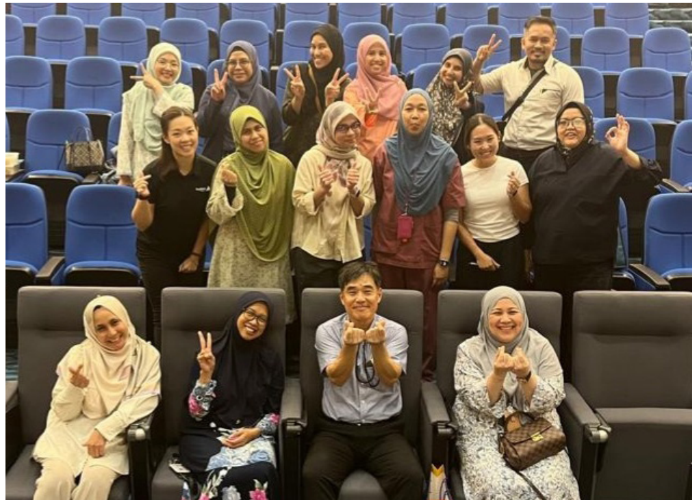
SOME of the workshop participants with our invited speaker, Dr Jimmy Nomura.

Jimmy Nomura, who shared invaluable insights through two lectures: an overview of minimally invasive gynaecological surgery and surgical techniques with tips and tricks. These sessions offered participants a comprehensive introduction to vNOTES, detailing both the clinical rationale behind the approach and practical surgical techniques.