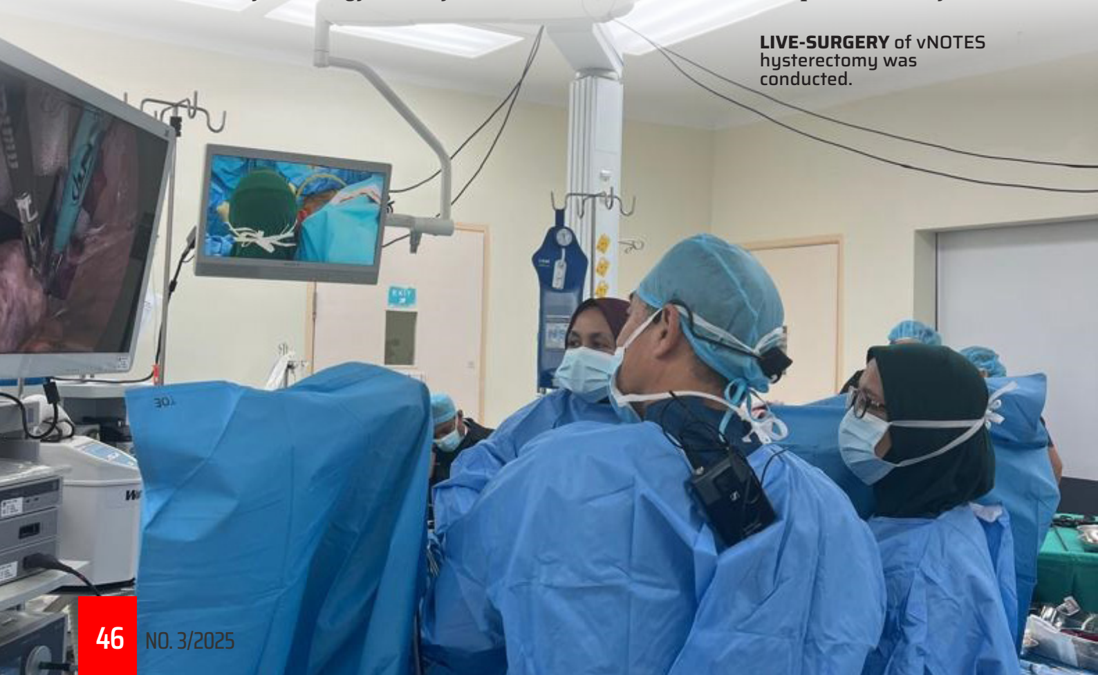
LIVE-SURGERY of vNOTES hysterectomy was conducted.