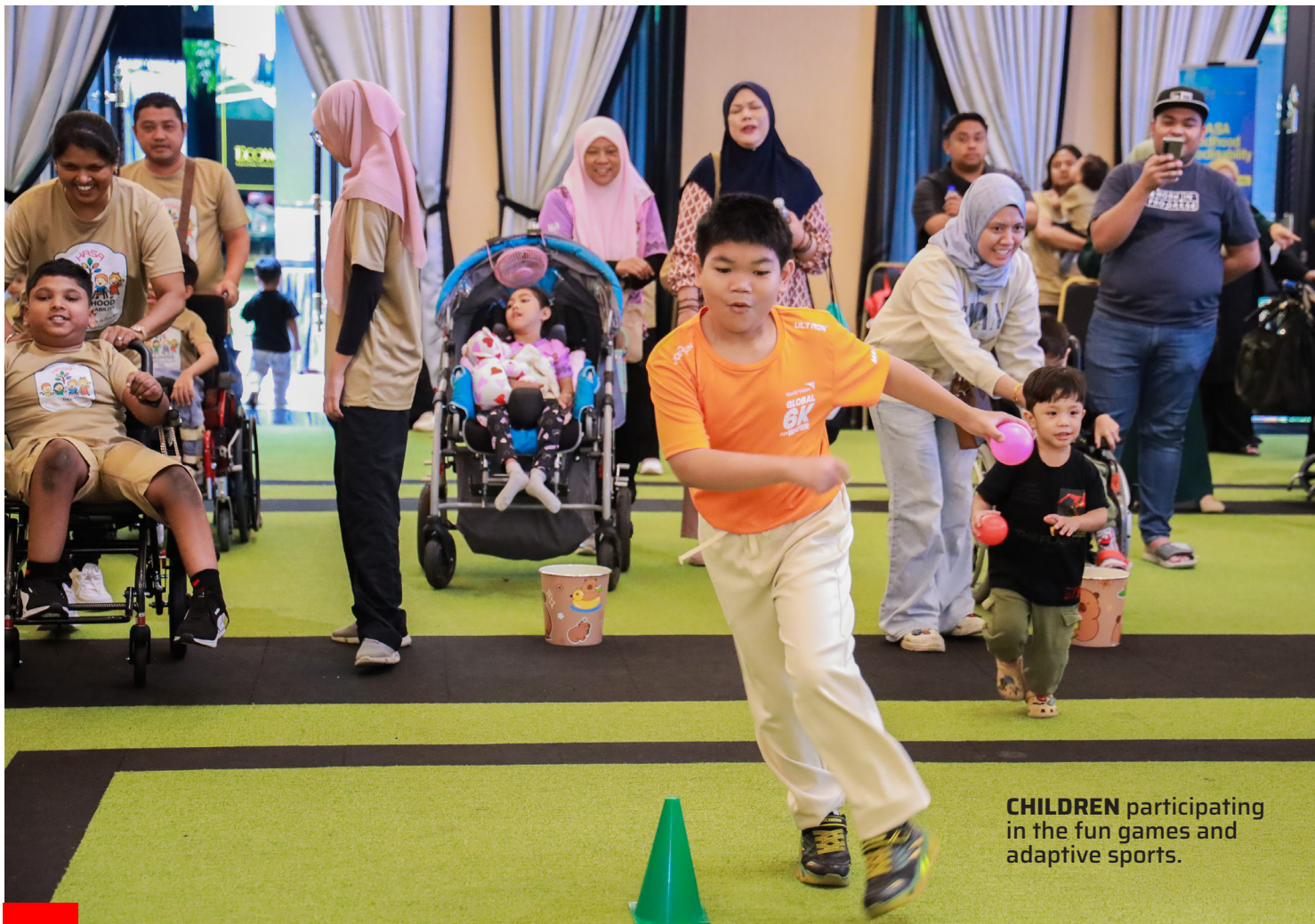
CHILDREN participating in the fun games and adaptive sports.