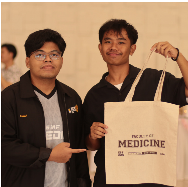
MEDICINE by SMF.

their participation, along with a team from the Jawatankuasa Perwakilan Kolej , added to the overall vibrancy of the sales area.