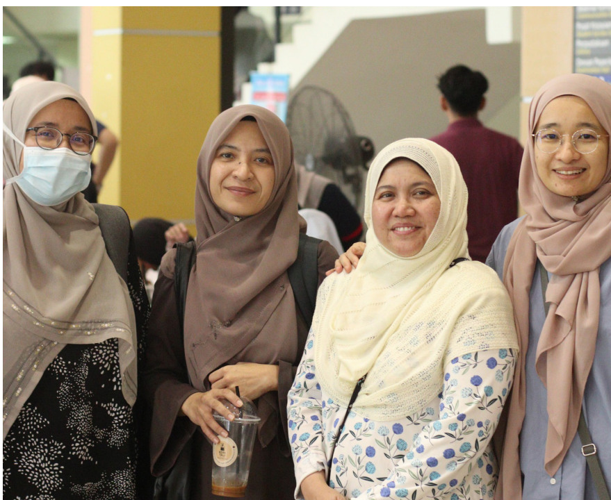
MEMBERS of Doctorpreneur.

There were 23 booths at the festival, 12 of which were run by our very own medical students. The Faculty of Business also participated by sending two groups of students, and