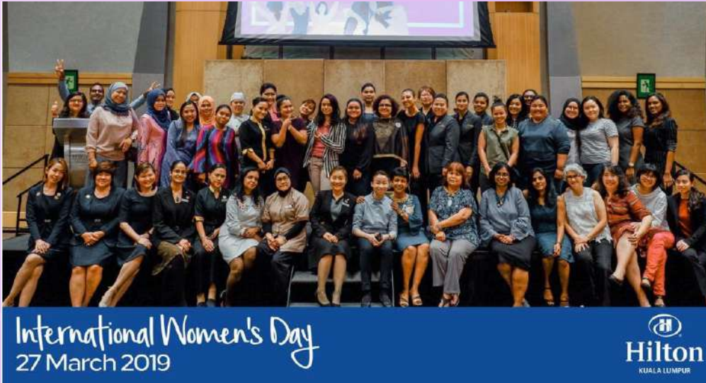
International Women's Day 2019, Hilton Kuala Lumpur