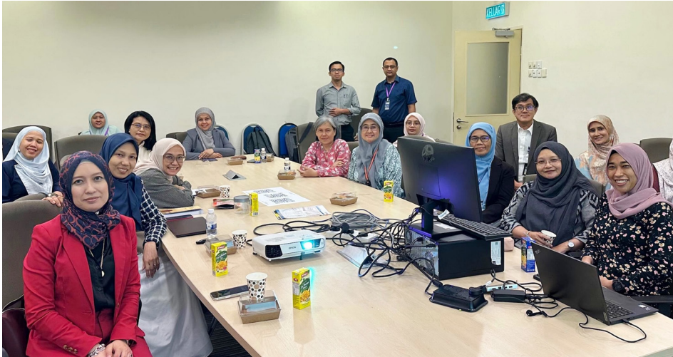
THE examiners and coordinators for the long case examination.