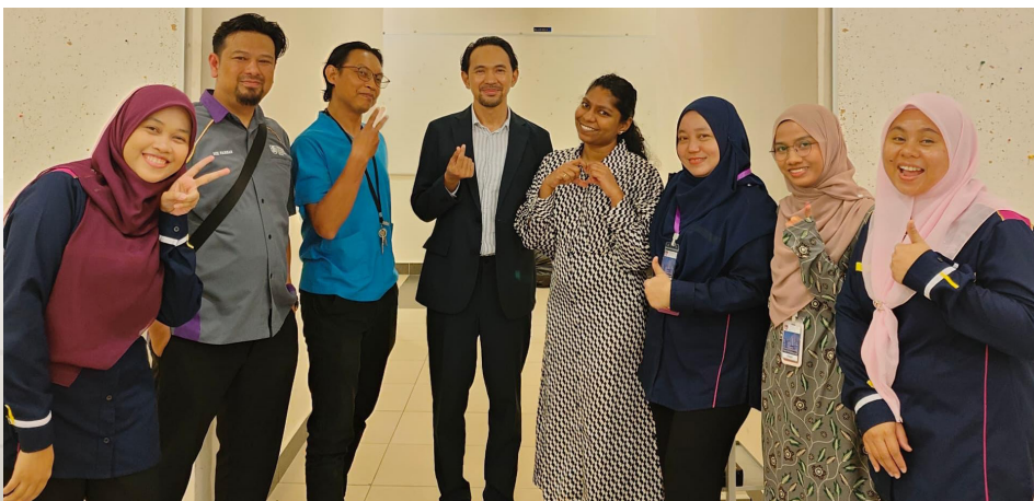
THE hard-working staff from the Department of Rehabilitation Medicine.