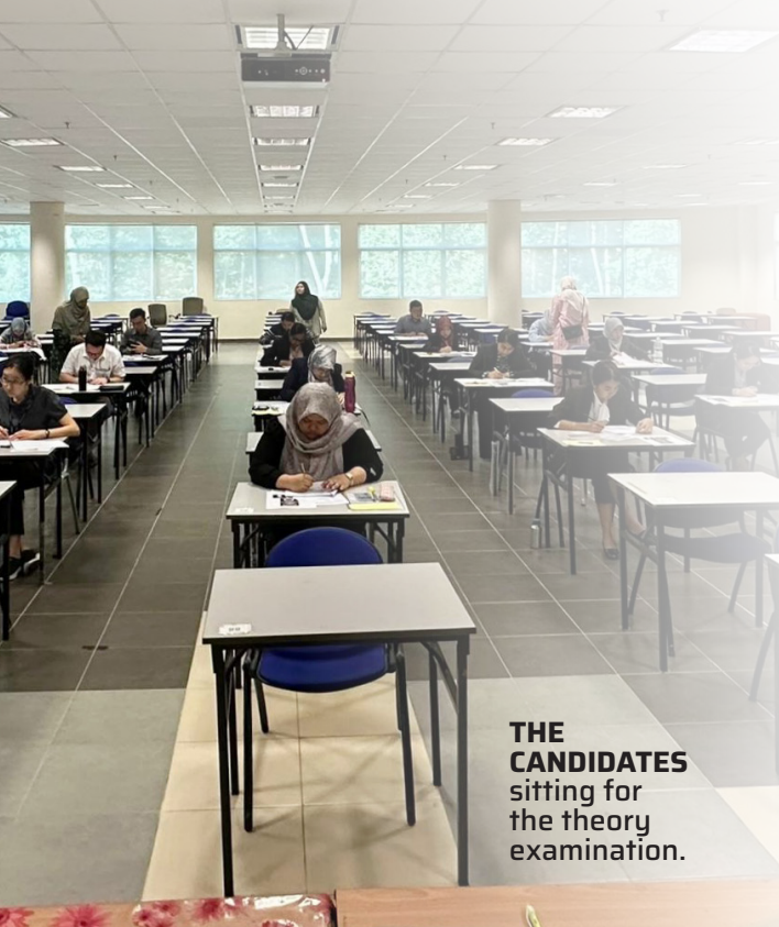
THE CANDIDATES sitting for the theory examination.

The department extends its sincere appreciation to all faculty members, administrative staff, examiners, and support personnel whose commitment and teamwork made this event a success. Whether working behind the scenes or on the ground, every contribution was vital.