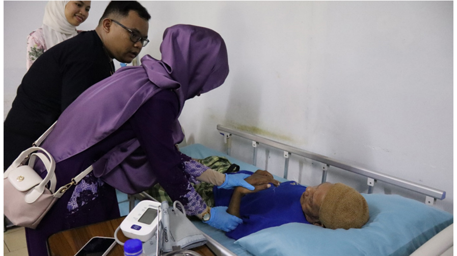
THREE clinical students performed a basic health check-up on one of the residents..