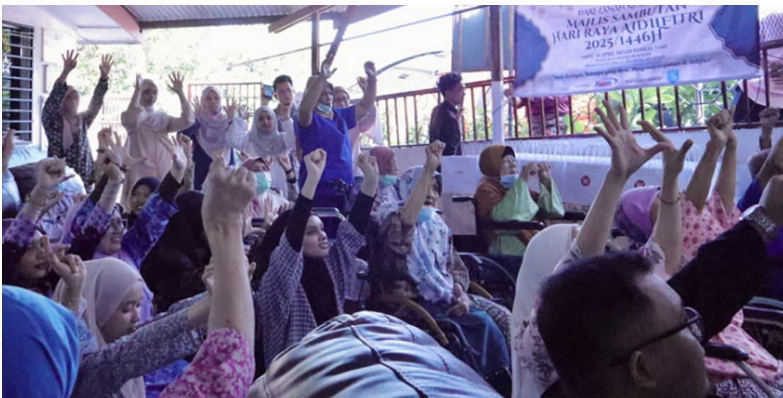
UiTM students joined the morning aerobic with the residents of Pusat Jagaan dan Rawatan Orang Tua Al-Ikhlash.

As educators, we take pride in programmes like this, which bridge clinical knowledge with community compassion. Zaman ke Zaman 2025 achieved its goals and left a lasting impression on everyone involved.