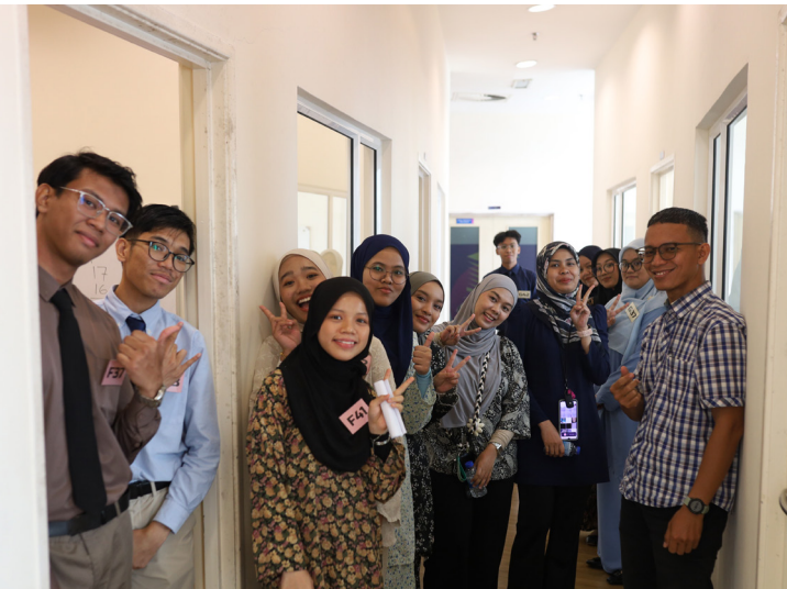
LOGISTICS staff assisting candidates during MMI 2025/2026 at the Faculty of Medicine, UiTM.