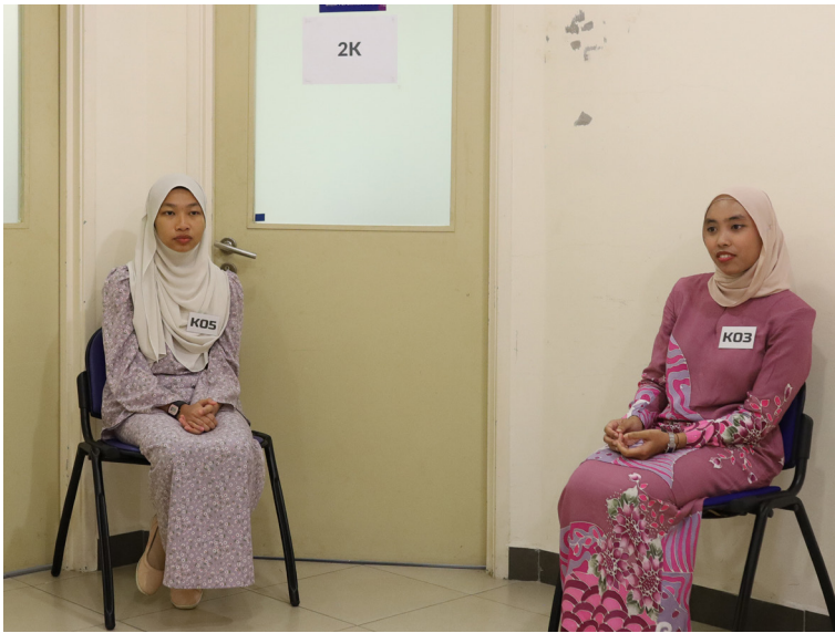
CANDIDATES seated outside interview rooms as per station allocation during MMI 2025/2026.