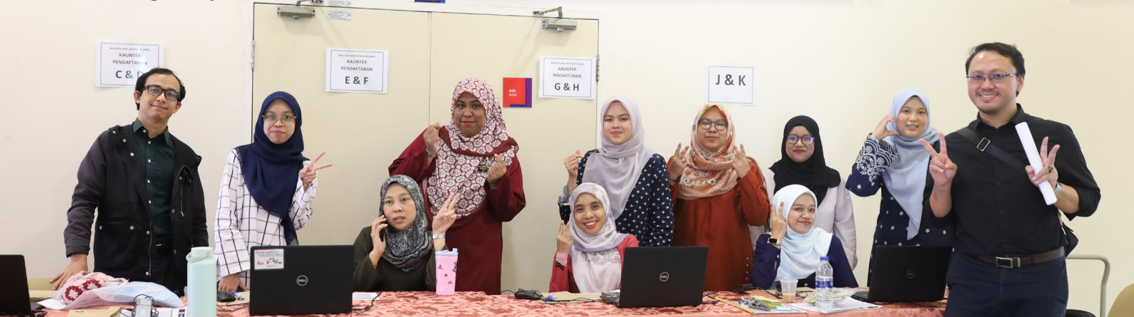
ORGANISING committee from the Academic Affairs, Faculty of Medicine, UiTM.