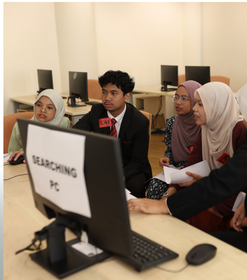
CANDIDATES engaging in group tasks during the MMI teamwork station.