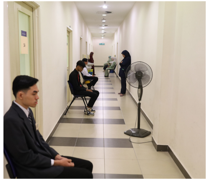
CANDIDATES waiting their turn to be interviewed.