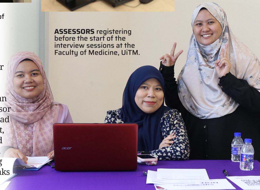
ASSESSORS registering before the start of the interview sessions at the Faculty of Medicine, UiTM.

The MMI 2025/2026 Organising Committee extends heartfelt thanks to all lecturers and staff of the Faculty of Medicine who served as assessors, as well as the faculty and department support staff for their tireless efforts and dedication. Their commitment was instrumental in making this year's MMI a success.