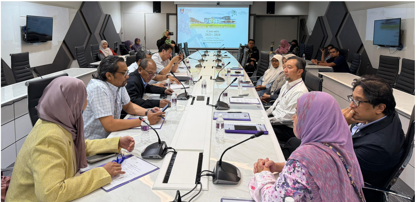
PRESENTATION and discussion at conference room, level 10.