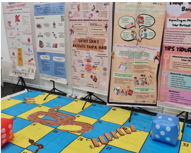
THE health exhibition and health games ‘Snakes and Ladders’.