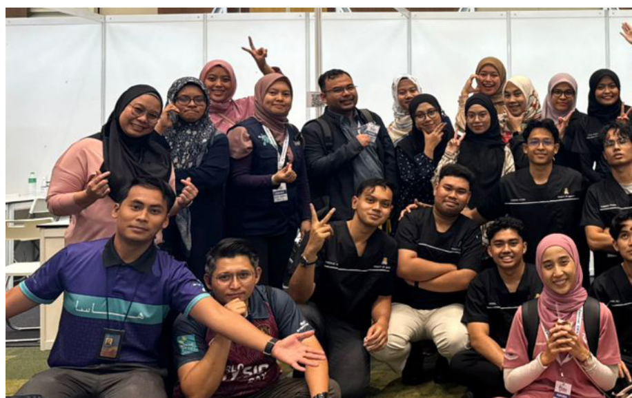
OUR medical undergraduate students enjoying the event.