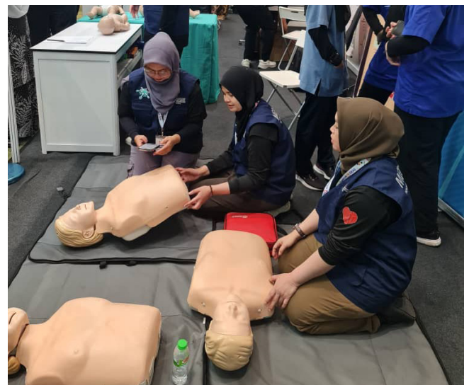
DEMONSTRATION to Basic Life Support.