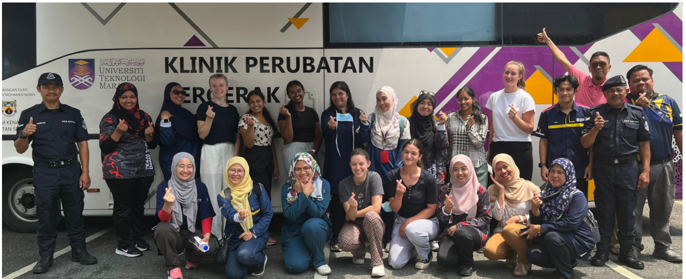
MEDICAL mobile clinic with Erasmus students from the Netherlands.