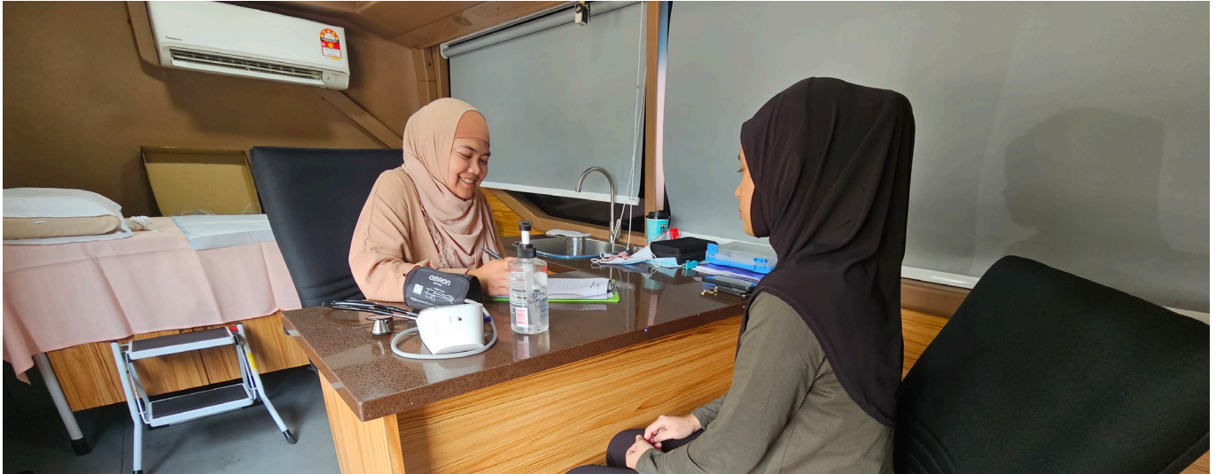
A family medicine specialist (FMS) consulting a patient inside the medical mobile clinic.