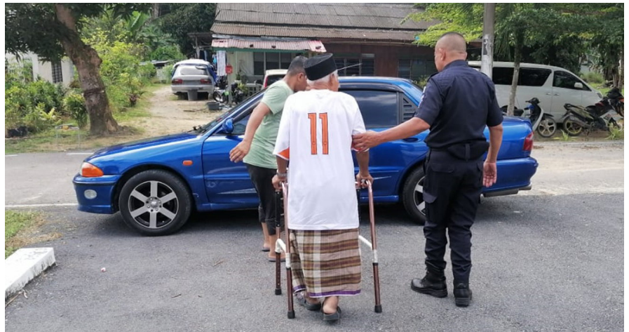
THE auxiliary police are helping a patient get into a car.

Our specialists have the luxury of time to discuss, explore, and provide health education to participants during this service. We aim to educate and empower patients to take charge of their health and manage their illnesses, adhere to medications, and attend regular follow-ups at local health clinics. This reflects our commitment