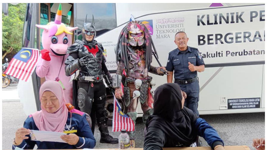
MEDICAL mobile clinic at MDSR color walk at Hutan Bandar, Simpang Renggam.