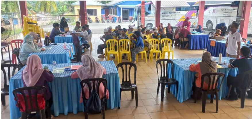
A family medicine specialist (FMS) consulting a patient inside the medical mobile clinic.