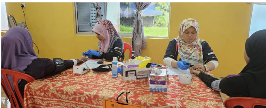
NURSES take the patient's random blood sugar.

PHARMACISTS are ready to dispense prescribed medications to the patients.