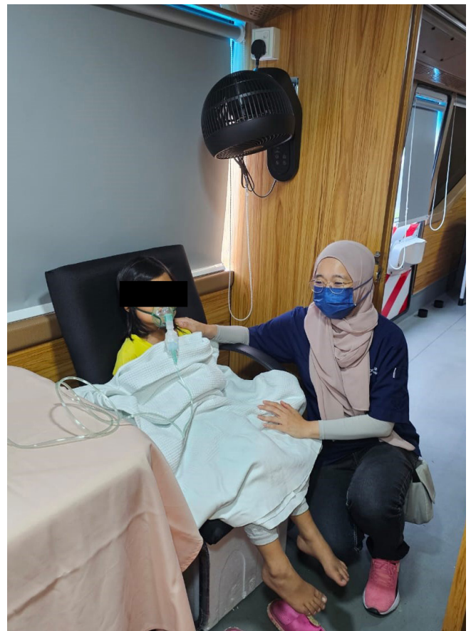
A family medicine specialist giving nebulizer treatment to a child with asthma.

Our UiTM medical mobile clinic has a unique feature that mimics a regular clinic; the public can 'walk in' and register at the registration counter. Patients will