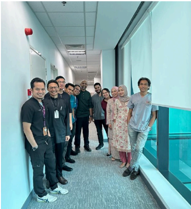
Figure 1: Participants of the Master of Orthopaedic Surgery and Traumatology workshop

The workshop also provided opportunities for each subspecialty unit to contribute in length regarding the subspecialty rotations. Each subspecialty rotation takes four months, and planning the schedule is essential to ensure the training and supervision run smoothly. To conclude the workshop, aspects of research and quality improvement in orthopaedic surgery were reviewed.