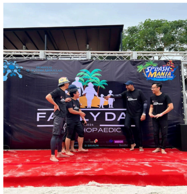
Figure 1: A cherished moment was shared between the Head of the Department and the medical officers.

For us, this one-day family bonding session was a moment to cherish, where we appreciated everyone in the department for their hard work, passion, and effort. At the same time, we wanted to celebrate the families that have been such a precious support to the department members. Together, we need to stick stronger than ever to progress and achieve our greatest success. Until we meet again next year.