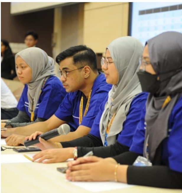
First round (UiTM vs. IMU)

Despite our student's best efforts to compete in this competition, they lost the battle against the two universities. After the competition, the students got to know their competitors from other universities, establishing networking among these six universities. They got to exchange experiences studying medicine at other universities, including private universities such as IMU and SEGi University.