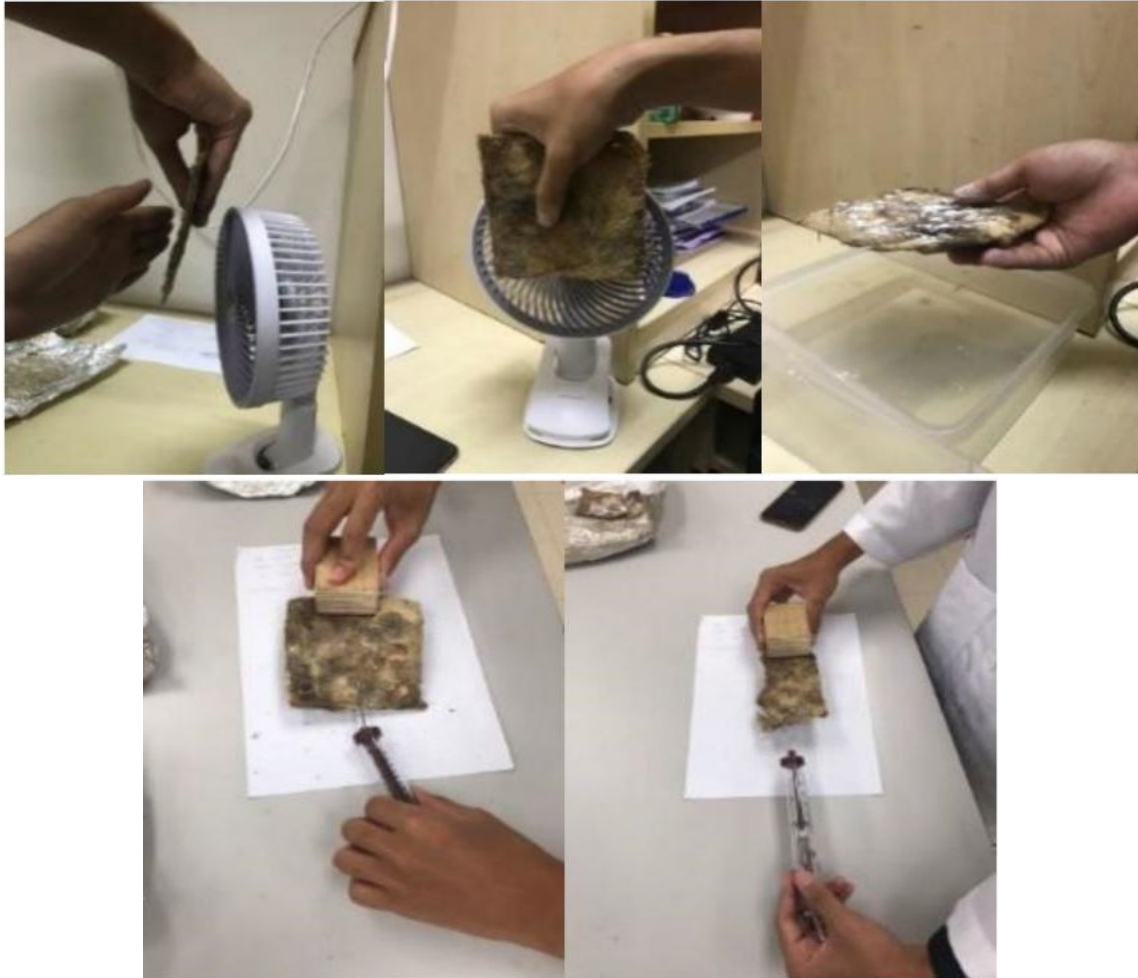
Figure 2: Testing the air flow, solid filtration and tensile strength.

any flour spilled or pass through the sample. The final testing is the tensile strength of each sample to measure the paper's durability and strength. The sample was measured using a spring balance and maximum force is applied until the paper tore up.