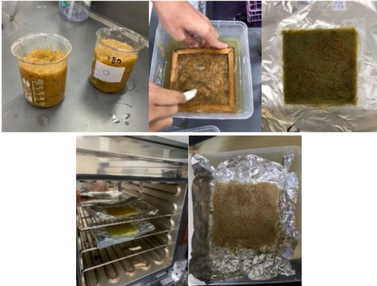
Figure 1: Papermaking process

The pulp is then poured into individual mold and spread evenly to form a sheets of paper. To ensure uniform thickness each sample has the same volume of 100ml and was subjected to compression to remove excess water. The sampels were left to dry thoroughly for testing.