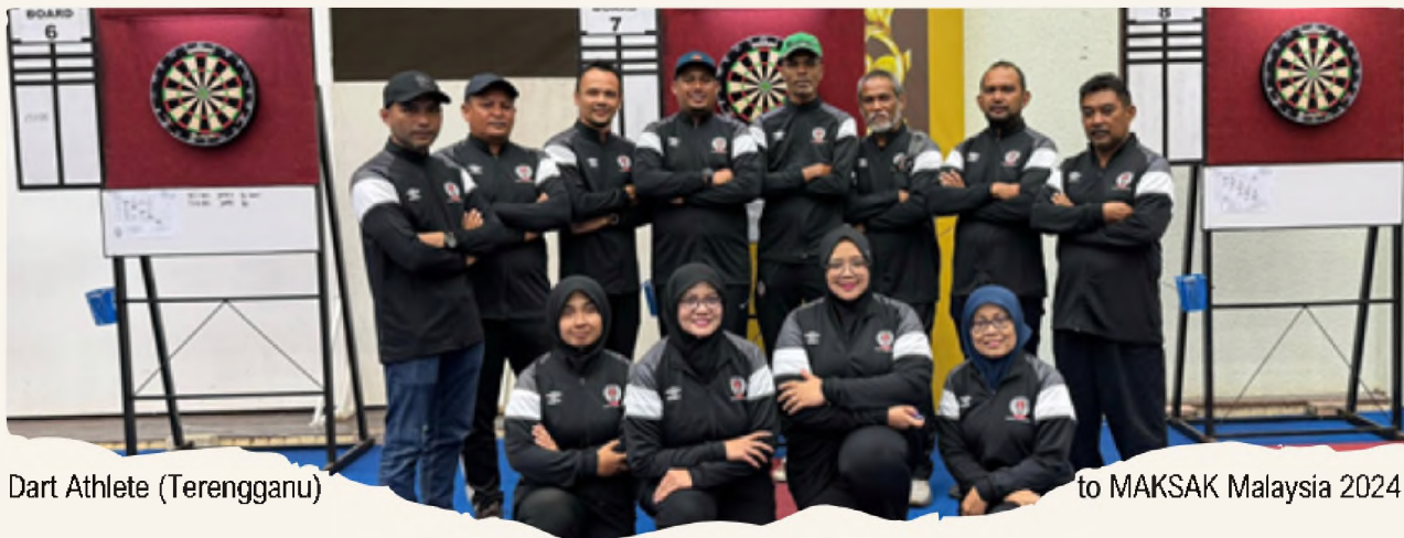
Dart Athlete (Terengganu)