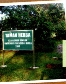
Signage installed in 2013