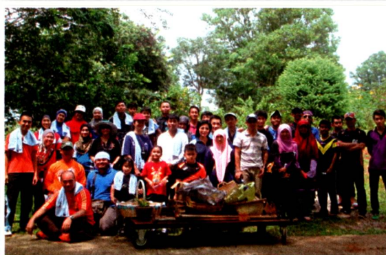
Gotong royong activities