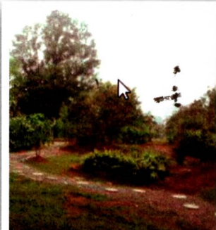
Six months later in 2013