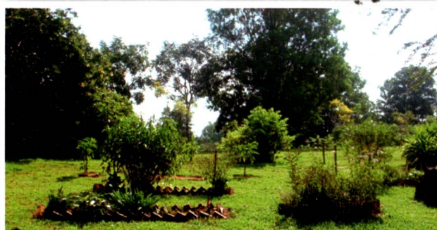
At the beginning in 2012

The Faculty of Plantation and Agrotechnology was involved in the rehabilitation project of the Sarawak State Library Herbal Garden in 2012. The garden was redesigned based on a theme that takes into consideration the herbal properties for culinary, medicinal, aromatic and pharmaceutical purposes. Some components were arranged in formal designs laid out as a series of beds creating some geometric forms like squares, circles or semicircles and other components in the form of an island. Hardscaping elements pulled all the components together with paths between the beds paved with circular cement blocks. After two years, the garden has matured under the tender care of the library staff and the occasional gotong royong activities by the students. 60 herbal plants are in the record list.