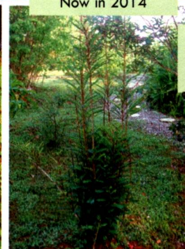
Naga Buana ( Phyllanthus pulcher )