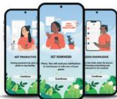
2. Apps features