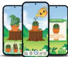
4. Game Features