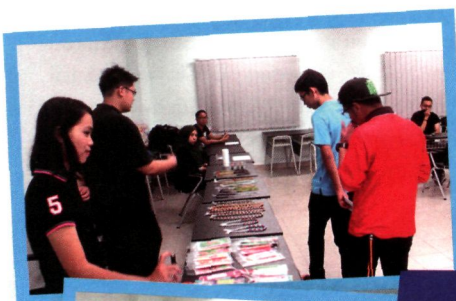
AUTISM DONATION DRIVE