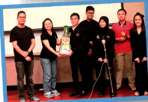
READERS' THEATRE 2015