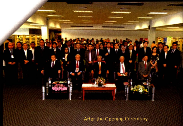
After the Opening Ceremony

Ten keynote speeches were delivered at ICBR 2020 by four Malaysian speakers and six international speakers on the first day of the Conference. The Malaysian speakers were Rector, Professor Dato Dr