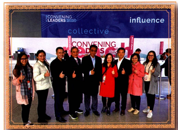
Host of Breakfast Net Session Energised by Business Events Sarawak - The Business Events Sarawak Team

All too soon, it was home bound and returning the extra 16 hours gained in San Francisco on arrival in Singapore before Kuching.