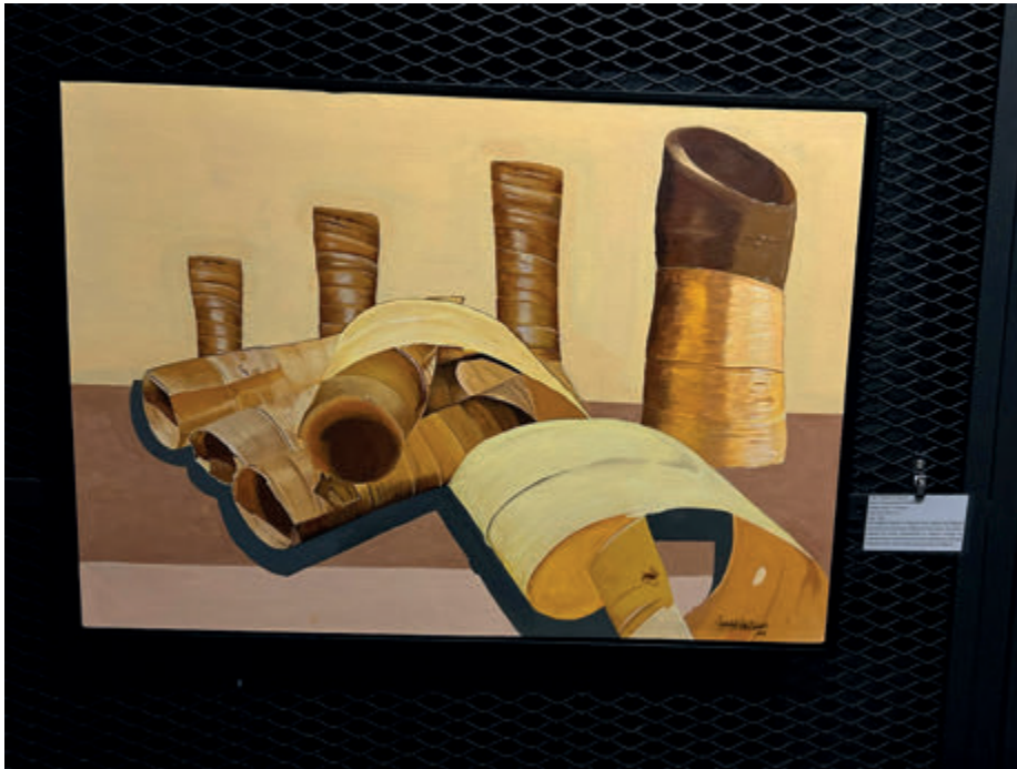
Title: "Sweetie of Segurut" Name: Nurpuspawati Binti Abdullah Media: Acrylic on Canvas Size: 59.4 x 84.1 cm Year: 2024

The traditional dessert of "Segurut" (Kuih Celorot) from Melanau symbolizes the uniqueness of Malaysian food culture. This artwork explores the visual characteristics of "Segurut" through the understanding of media dimensions which highlights the elements of structure, form, colors, pattern and proportion of "Segurut".