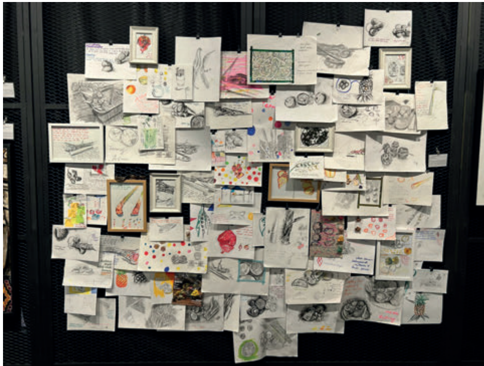
Title : The Harvests Diary! Name : Shah Izzah Adila Maulad Taib Media : Mixed Media Size: 14.85 x 21cm - 29.7 x 42 cm Year: 2024

The artwork documents the Sarawak's indigenous popular harvest foods Terung Dayak, Asam Paya, Tepus, Paku pakis, Paku pakis Uban, and Midin at Pasar Tamu through the understanding of the media dimension. The idea of highlighting the texture and shape of the local harvests that are attached as a free-standing stack laden with tetradic pop colors.