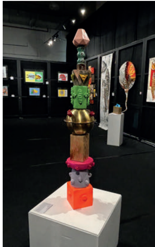
Title : The Harvests Observation Name : Shah Izzah Adila Maulad Taib Media: Mixed Media Size : 5ft ( 152.4 cm) Year: 2024

The artwork documents the Sarawak's indigenous popular harvest foods Terung Dayak, Asam Paya, Tepus, Paku pakis, Paku pakis Uban, and Midin at Pasar Tamu through the understanding of the media dimension. The idea of highlighting the texture and shape of the local harvests that are attached as a free-standing stack laden with tetradic pop colors.