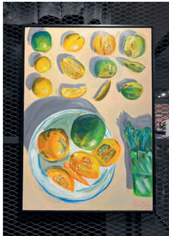
Title : The Harvest Minimalist ! Name : Shah Izzah Adila Maulad Taib Media : Oil Paint on Canvas Size : 59.4 x 84.1 cm Year: 2024

The artwork documents the Sarawak's indigenous popular harvest foods Terung Dayak, Asam Paya, Tepus, Paku pakis, Paku pakis Uban, and Midin at Pasar Tamu through the understanding of the media dimension. The idea of highlighting the texture and shape of the local harvests that are attached as a free-standing stack laden with tetradic pop colors.