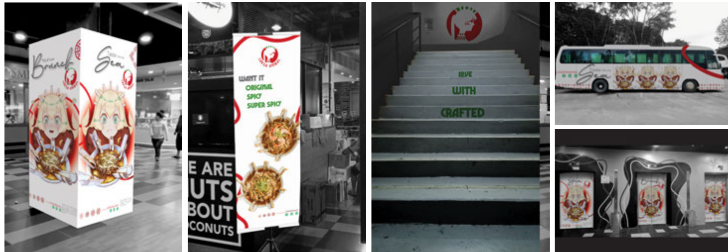
FIVE MEDIA PLATFORM