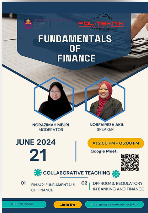
Collaborative Teaching Poster

On May 14, 2024, and June 21, 2024, Universiti Teknologi MARA (UiTM) Mukah Campus and Politeknik METRo Betong Sarawak collaborated to provide guidance to finance students from both institutions. The collaborative teaching program focuses on two core subjects: DPF40043 (Politeknik) and FIN242 (UiTM).