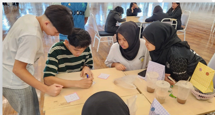
The students were playing games and having fun