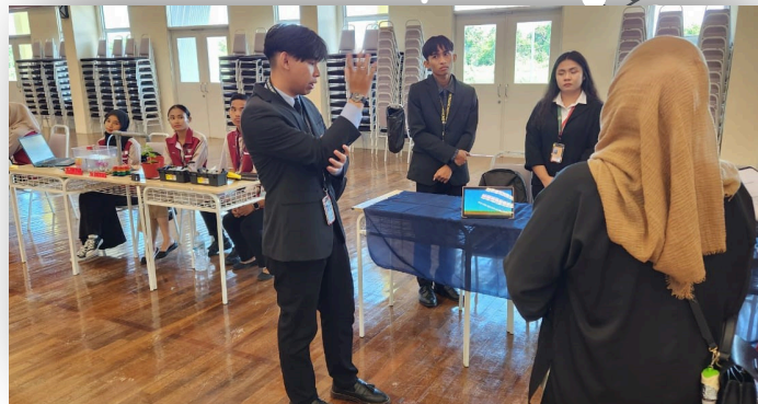
The IID participants wooed the judges